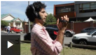
Recording great audio