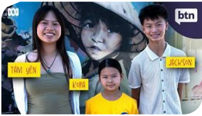
Vietnamese Refugee Anniversary

As a class watch one or more of the following BTN stories to learn more about the experiences of refugees. After watching any one of the BTN videos ask students to respond to the discussion questions (to find the teacher resources go to the related BTN Classroom Episode and download the Episode Package).