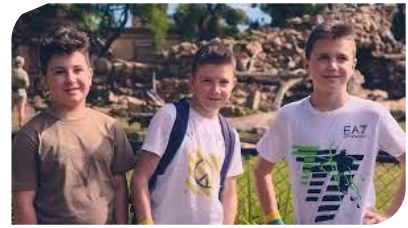
Journey from Ukraine