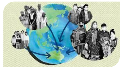
Refugees in Australia