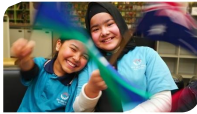
World Refugee Day