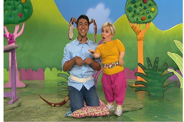
How To Play A Dog Training Game

Cut 5 pieces of string 2 long, 3 short. Add pegs to each end. Tie string to coat hanger. Tie knot at end of short scarf (legs). Tie knot at end of long scarf (arms). Place short scarf over long scarf, put rolled socks in middle, wrap hair band around socks to look like head. Place ball of wool on head as hair. Clip head, two arms and two legs with pegs. String a ling now ready to move.