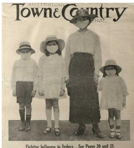
National Museum Australia