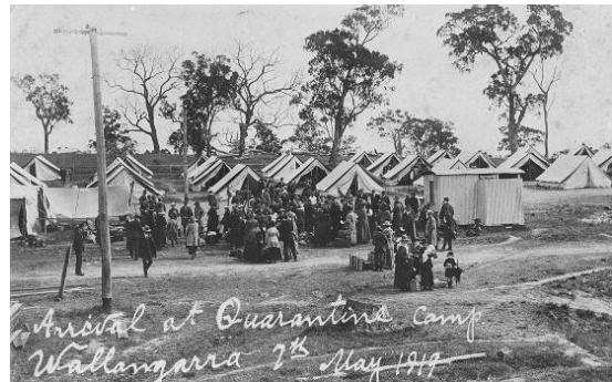
National Australia Museum