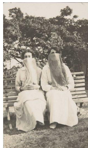
National Museum Australia