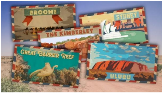
Indigenous Place Names

Students can watch one or more of the BTN stories below to learn more about Indigenous languages.