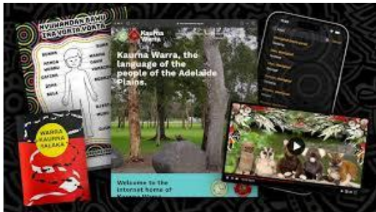
Reviving Indigenous Languages