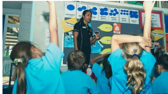
Indigenous Language Lessons