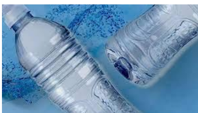
BTN Bottled Vs Tap Water