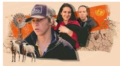
BTN Drought Kids