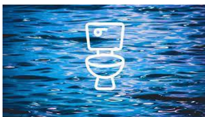
BTN Where does toilet water go?