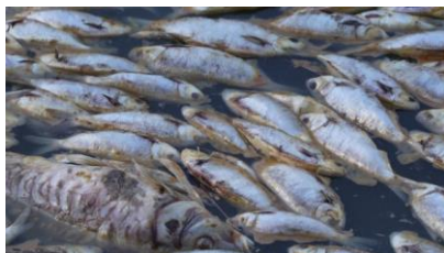
BTN Darling River Fish Deaths