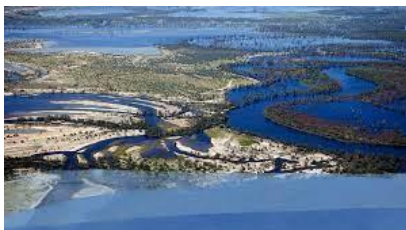
BTN Murray-Darling Wetlands

Watch these BTN videos to help students understand more about water related issues.