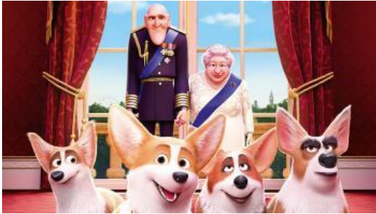
The Queen’s Corgi movie (PG)