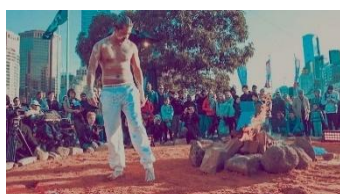
What is a treaty?