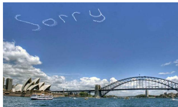
National Apology to the Stolen Generations