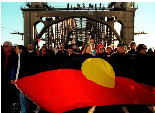
Walk for Reconciliation