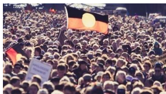
Bridge Walk Anniversary