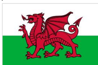
Wikipedia – The flag of Wales