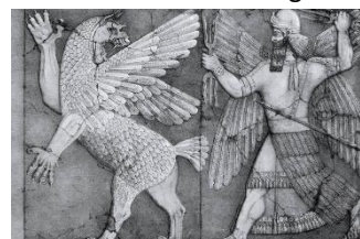
Dragon Enma Elish