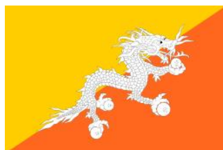
Wikipedia – The flag of Bhutan