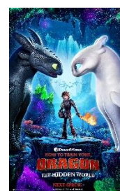
DreamWorks – How to Train a Dragon movie