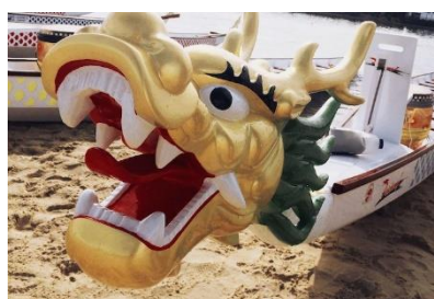
BTN – Dragon boat racing