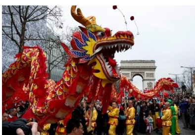
ABC News – Dragon dance performances