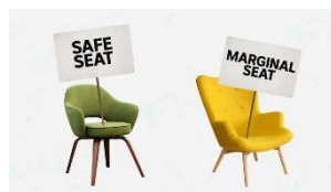
Safe and Marginal Seats