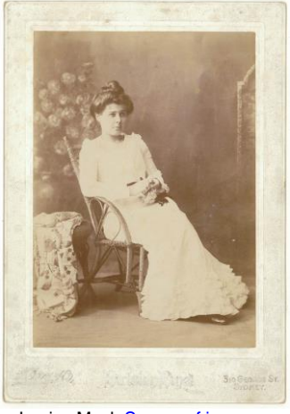
Louise Mack Source of image