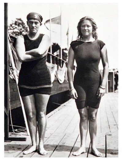
Fanny Durack & Mina Wylie Source of image

Students will choose a well-known Australian woman to research and write a biography about. They can choose one of the women featured in the BTN story (see images below) or someone else. There is a list some prominent Australian women in the biography section in this activity.