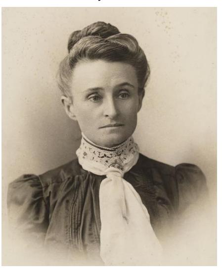
Edith Cowan Source of image