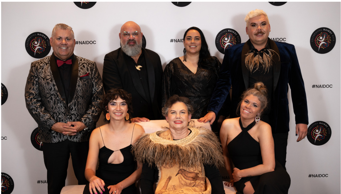
The 2023 National NAIDOC Committee.