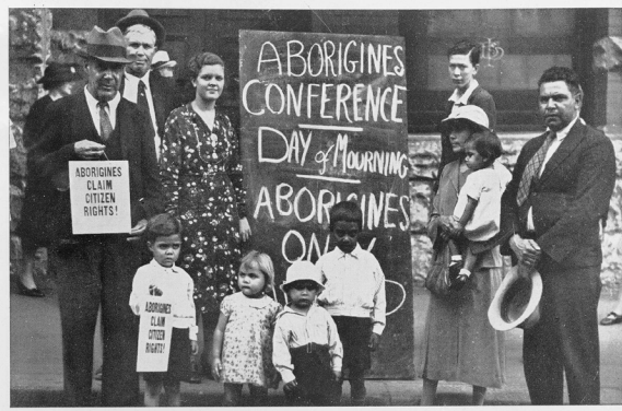
A LARGE BLACKBOARD displayed outside the hall proclaims, “Day of Mourning.” Leaflets warned that, “Aborigines and persons of Aboriginal blood only are invited to attend.” At 5 o’clock in the afternoon resolution of indignation, protest, was moved, passed.

“Keep the Fire Burning!’ is a nod to the vitality and endurance of culture, and a nod to connection with Country and community.” - National NAIDOC Committee. (SBS: sbs.com.au/nitv/article/the-2024-naidoc-theme-has-been-announced-heres-what-you-need-to-know/jwy430k5t )