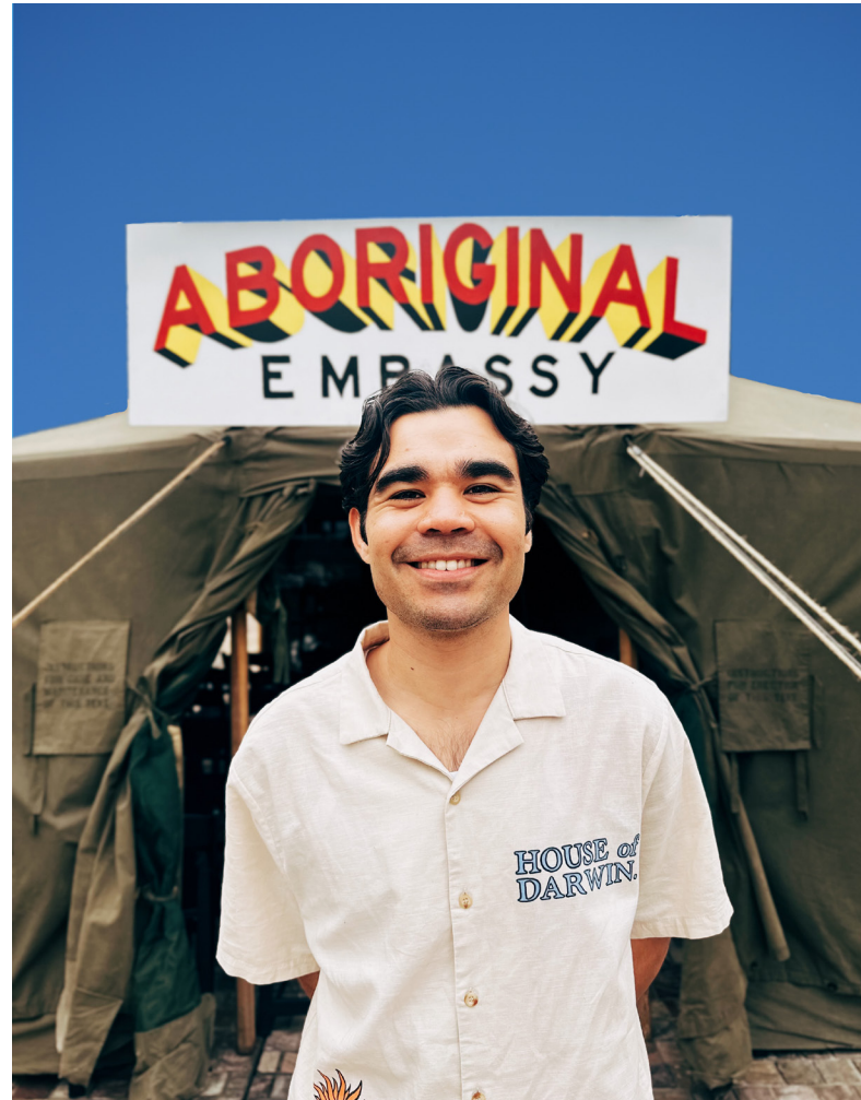
Image: Aboriginal Tent Embassy art installation.