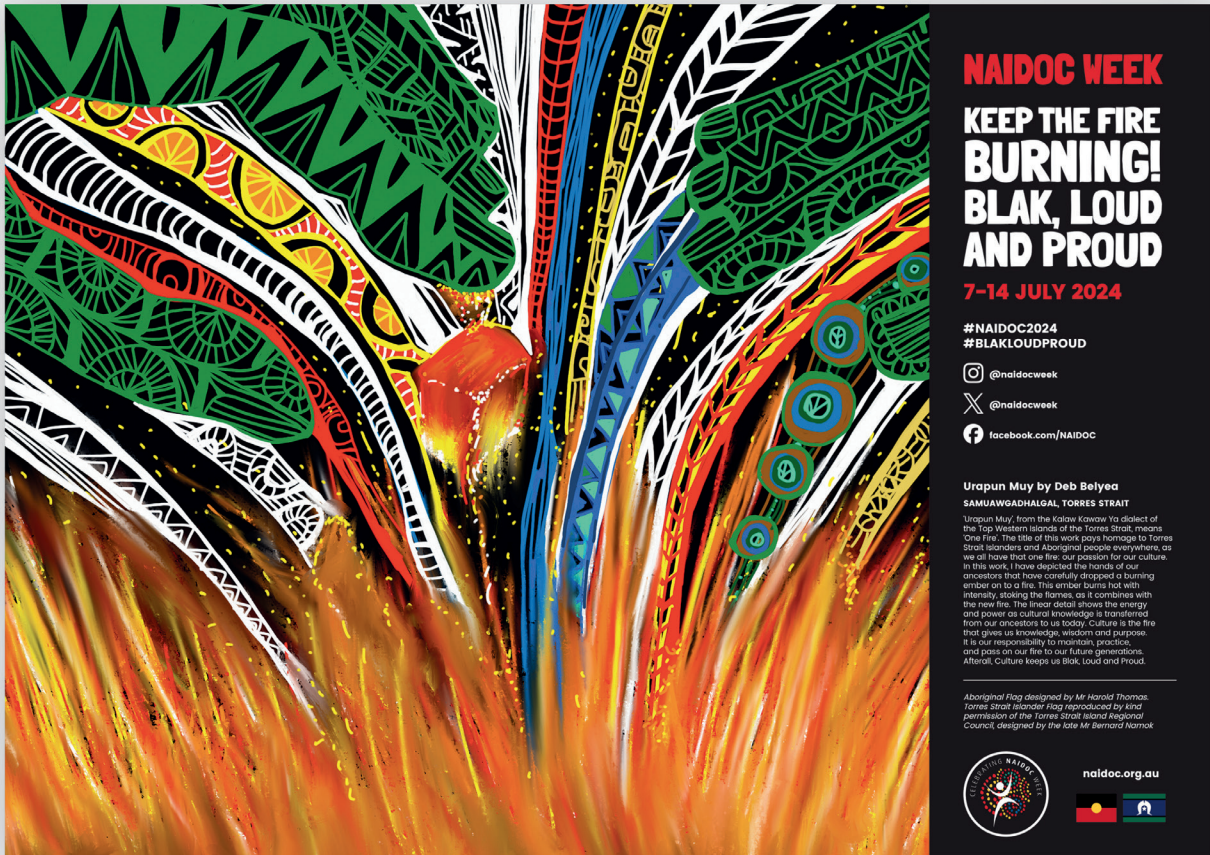
The 2024 NAIDOC Poster. (Credit: National NAIDOC Committee)