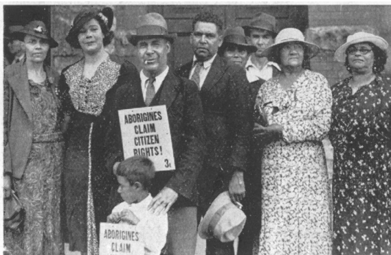
Image: Group of Aborigines with protest sign. (Credit: AIATSIS Collection)

Image: The first Day of Mourning. (Credit: AIATSIS Collection)