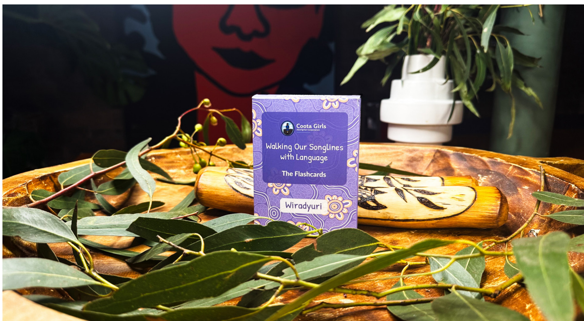
Image: 'Walking Our Songlines with Language' The Flashcards.