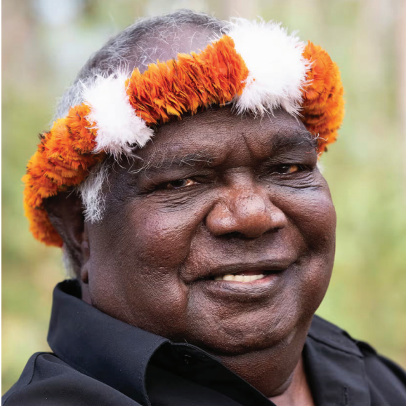
Image: Galarrwuy Yunupingu AM.