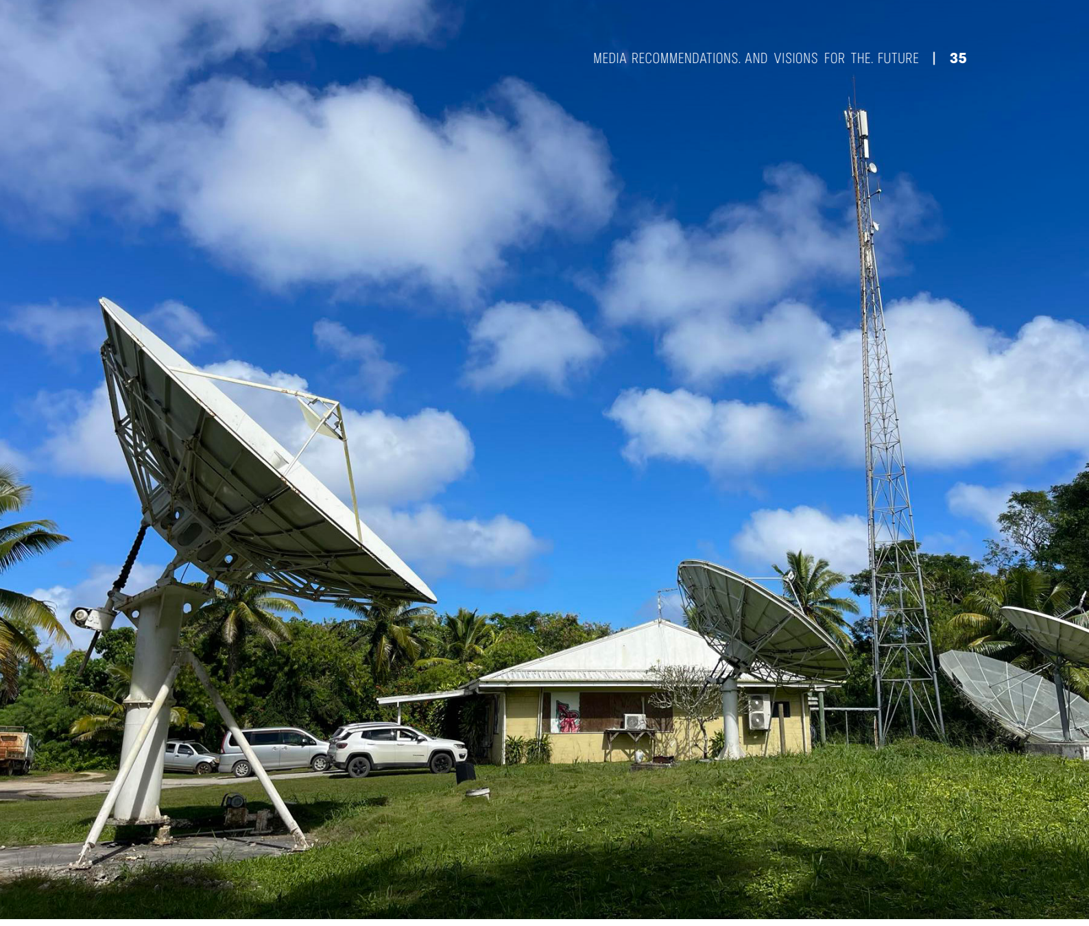
Headquarters of the Broadcasting Corporation of Niue.