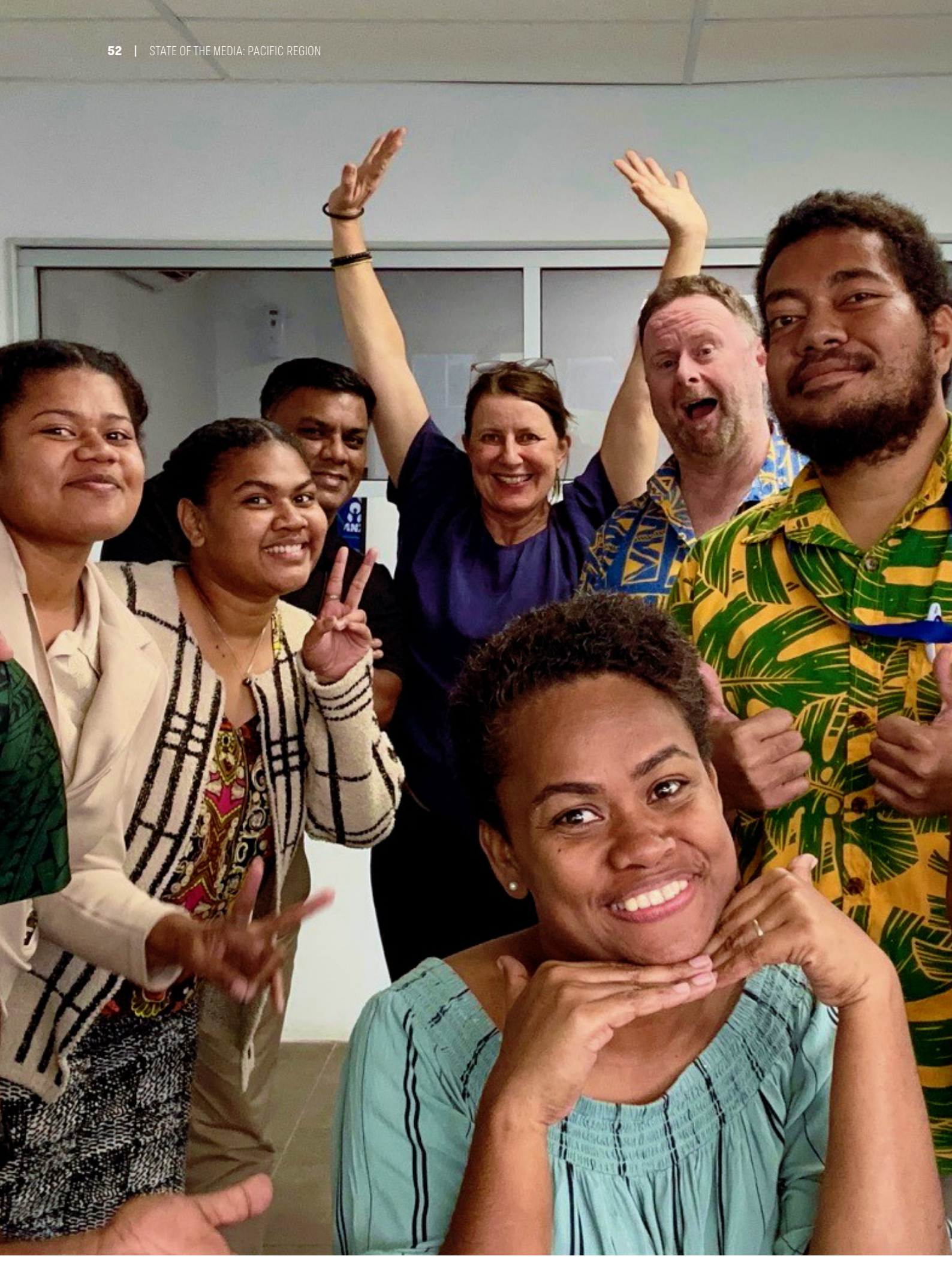
Mobile journalism training at the Fiji Sun.