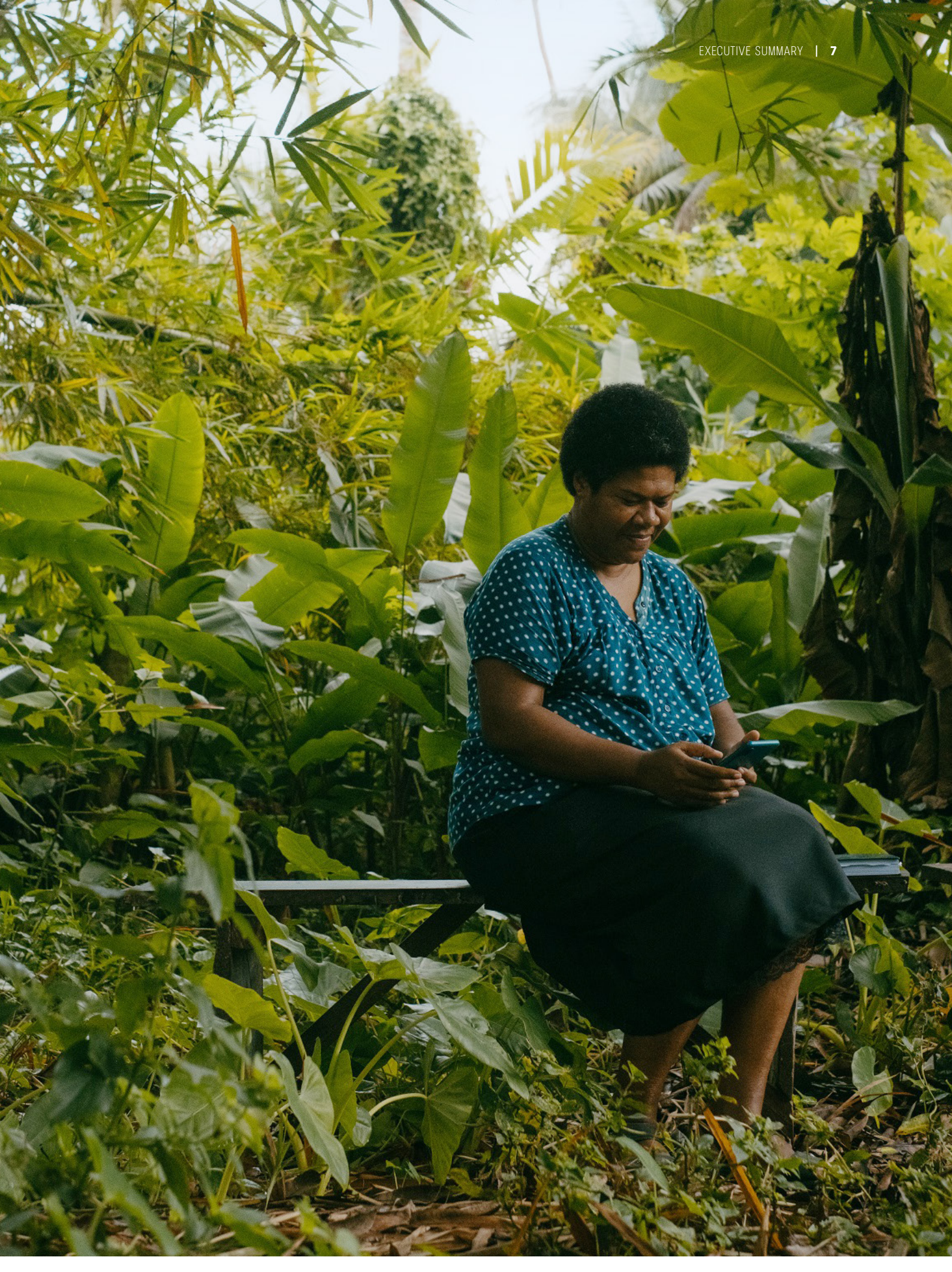
Reading the news in Lekutulevu, Vaturova, Cakaudrove Province, Vanua Levu, Fiji.