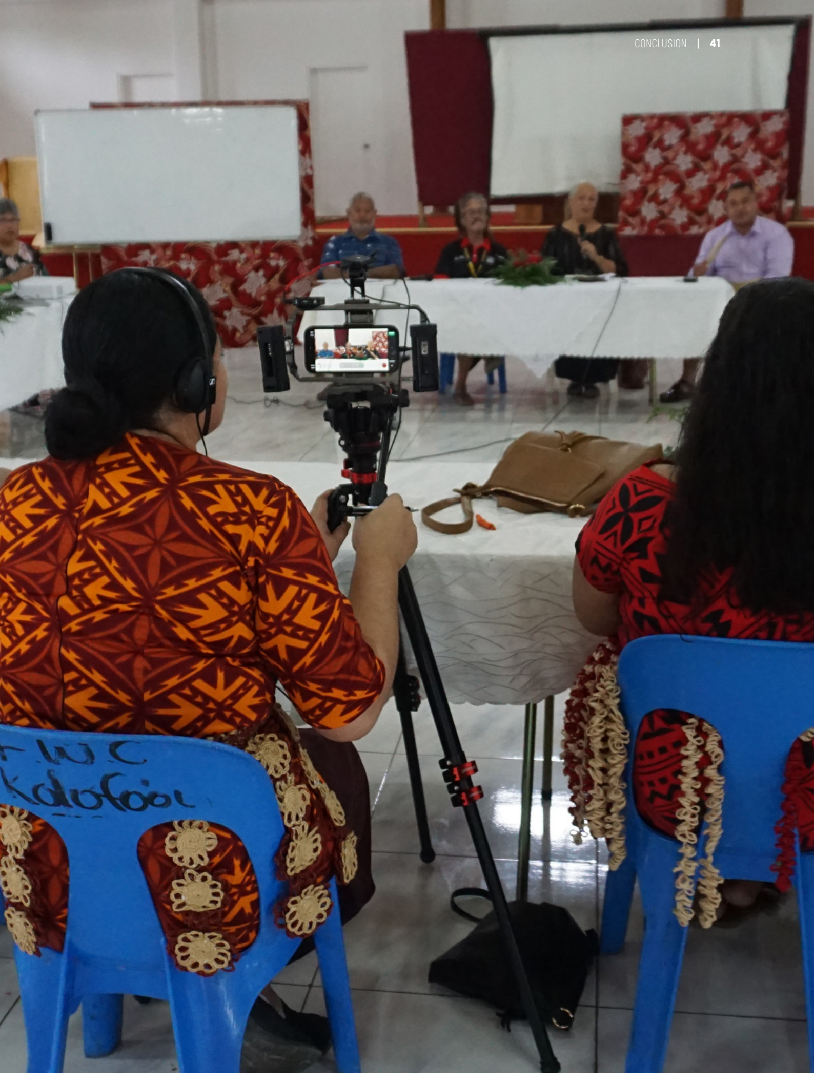
{\it Young journalists interview veterans of the Tongan media}.