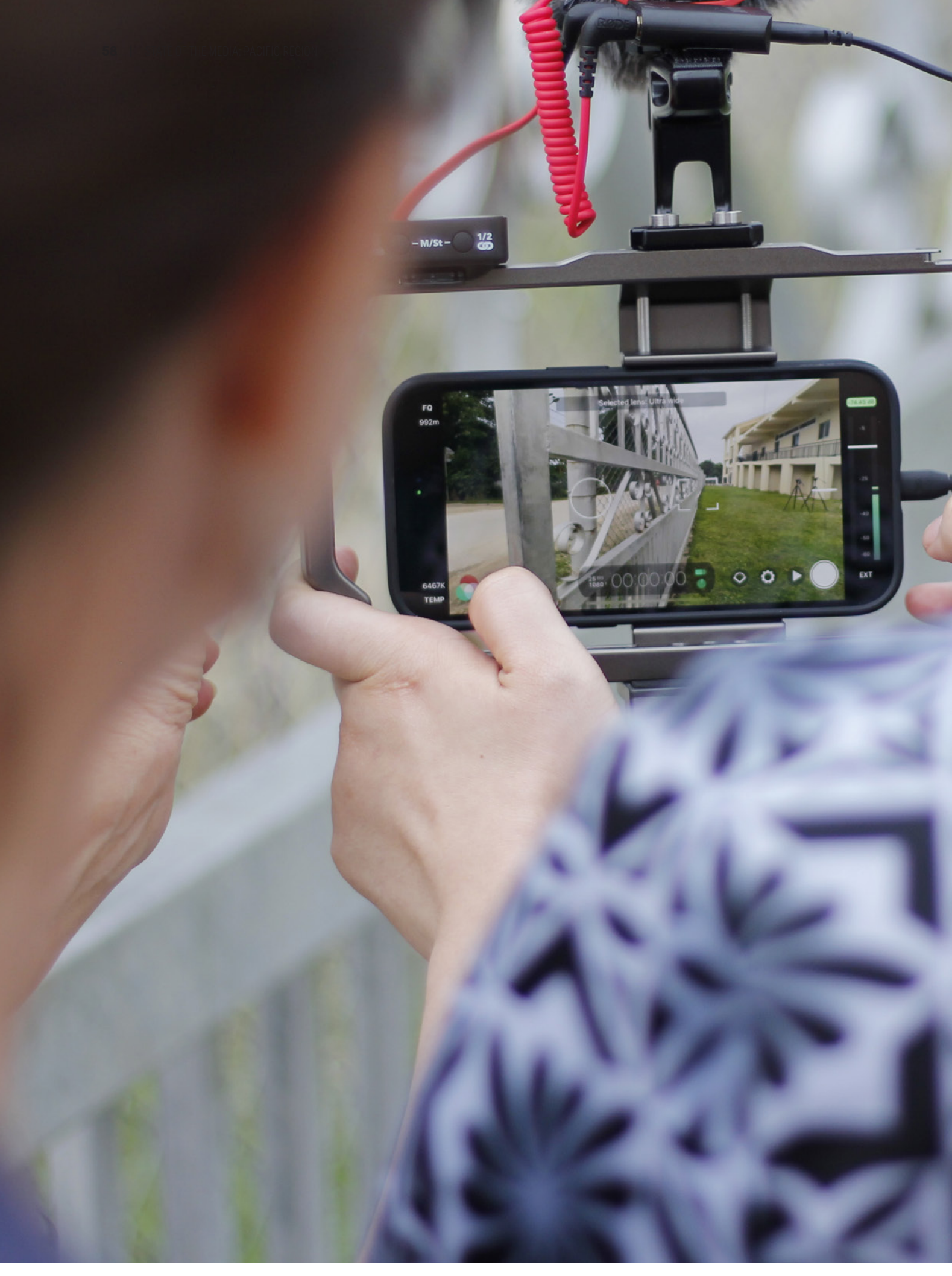
Learning to shoot with a mobile phone at Tonga Broadcasting Commission.