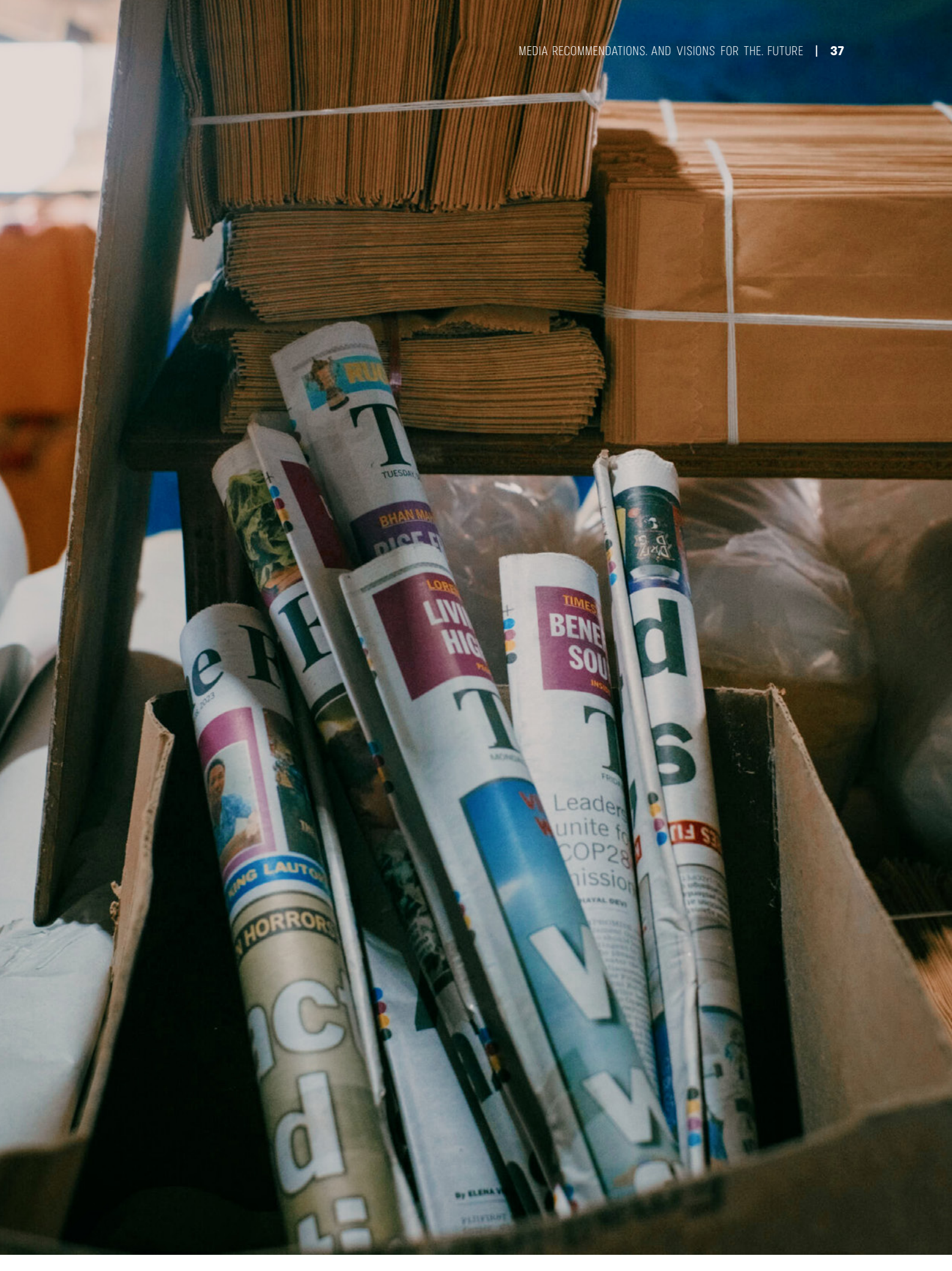
Fiji Times newspaper for sale, Savusavu Market, Vanua Levu, Fiji.