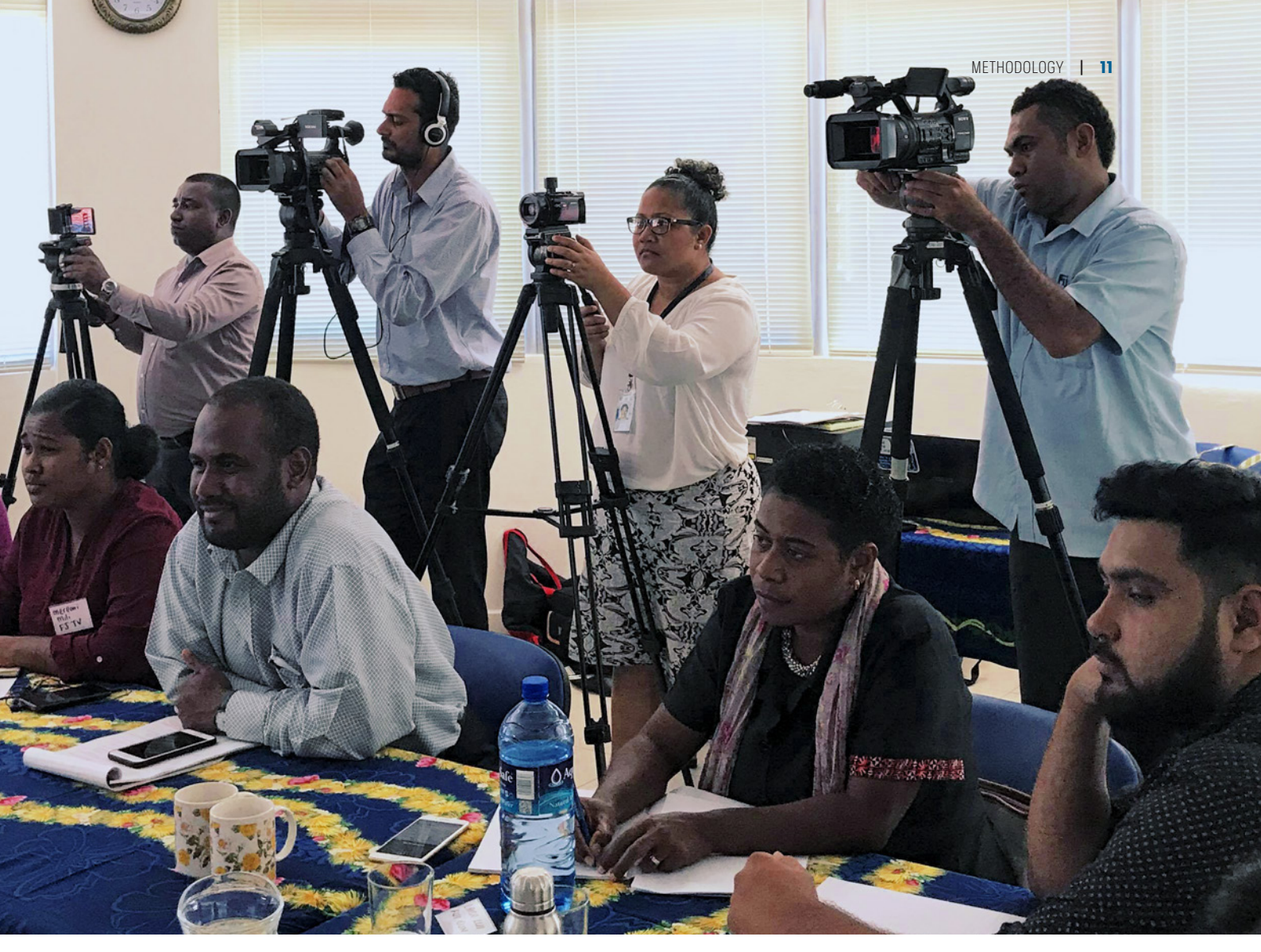
Covering a Minister's presentation to the media during a budget reporting workshop in Fiji.

A central challenge discovered during fieldwork was that access to certain groups was hard to establish, particularly in nations where the media operates under stringent government regulation. As such, the views represented in this study cannot be regarded as exhaustive. Both the interview and the survey questions are included as appendices 3 and 4 to this report. Fieldwork was conducted between January and July 2024.