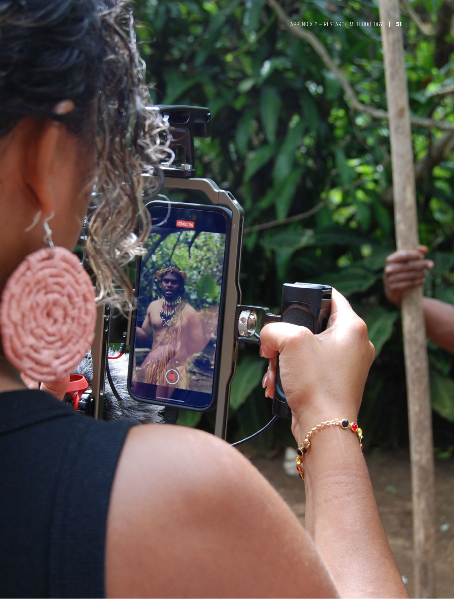
Shooting vertical video at the Pepeyo Cultural Village in Port Vila.