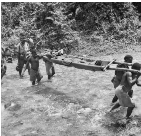
New Guinea, Kokoda Track, 1942