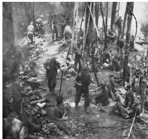
Papua, New Guinea, 1942 – Australian War Memorial