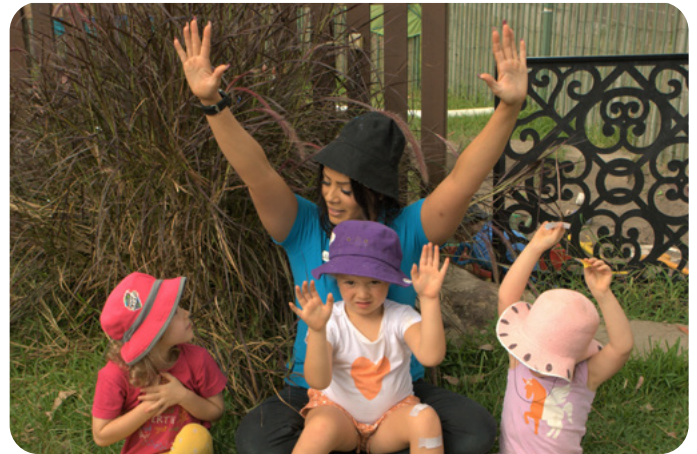
Acknowledging Darkinjung Country at Footprints Early Learning Centre, Erina NSW.

Help children verbally describe and record any sounds they hear using an audio recording