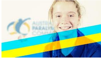
Paralympics Champ Isis Holt