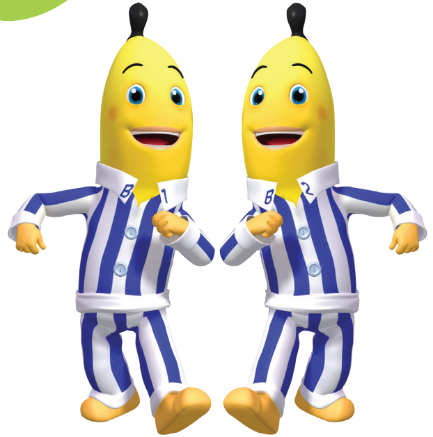
Bananas in Pyjamas