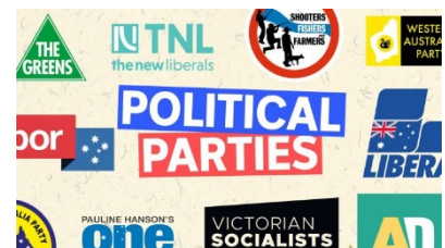
BTN Election Lingo video