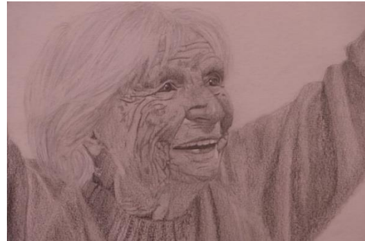
Catherina by Olympia