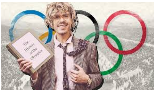
BTN Olympic Games History

To learn more about the history of the Olympic Games and how they have changed over time, check out the videos below.