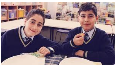
Syrian Refugee Family

As a class watch one or more of the following BTN stories to learn more about the experiences of refugees. After watching any one of the BTN videos ask students to respond to the discussion questions (to find the teacher resources go to the related BTN Classroom Episode and download the Episode Package).