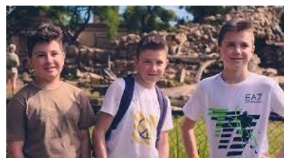
Journey from Ukraine