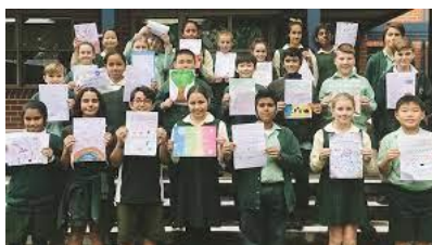
Letters to Refugees