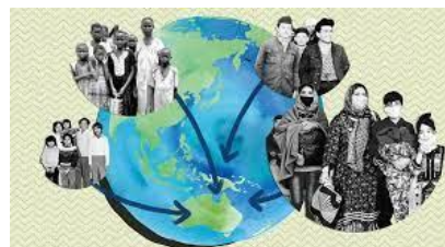
Refugees in Australia