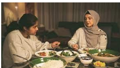
Refugee Week 2019