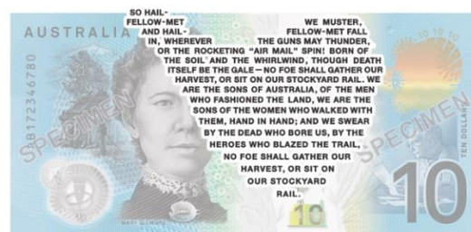
Microprinting ( RBA )

As a class, listen to the microprint excerpt from Dame Gilmore's No Foe Shall Gather Our Harvest , a poem that united the Australian people against the growing fear of Japanese invasion.