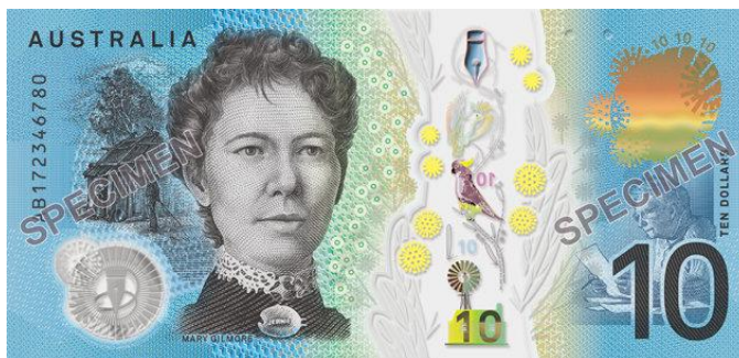
Australian $10 Banknote ( RBA )