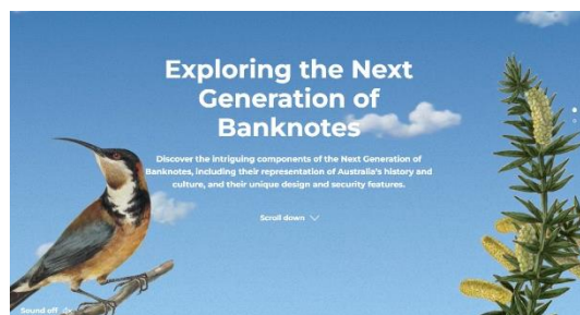
Interactive App ( RBA )

Focus on the $10 banknote and find out as much as you can about Dame Mary Gilmore. Students will try to find answers to the questions they wrote during their investigation.