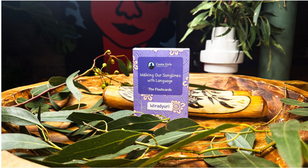
Image: 'Walking Our Songlines with Language' The Flashcards.