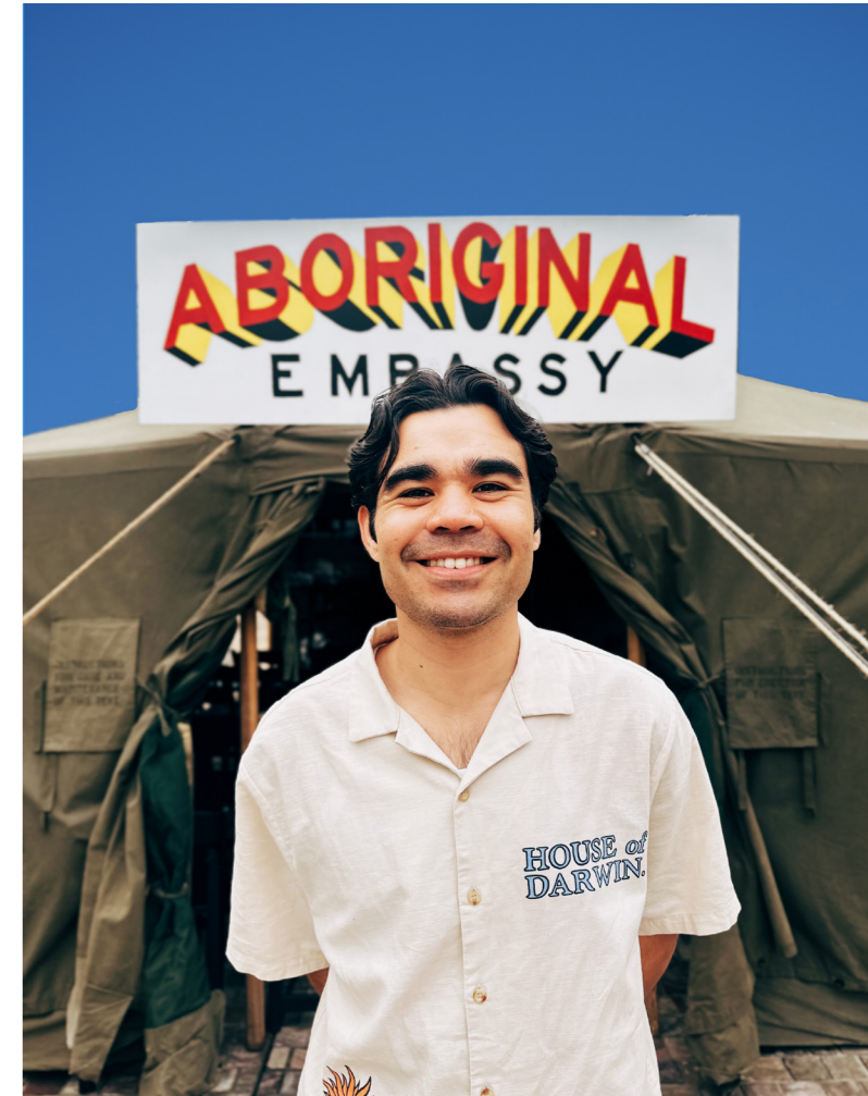
Image: Aboriginal Tent Embassy art installation.