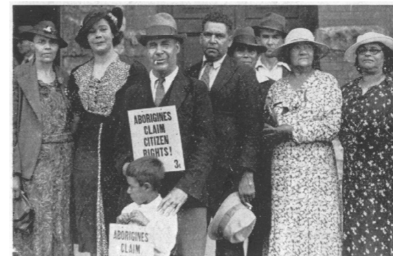
Image: Group of Aborigines with protest sign.