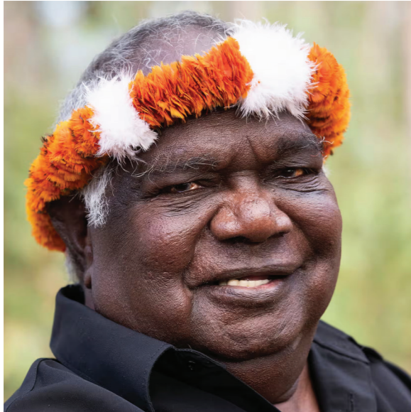
Image: Galarrwuy Yunupingu AM.