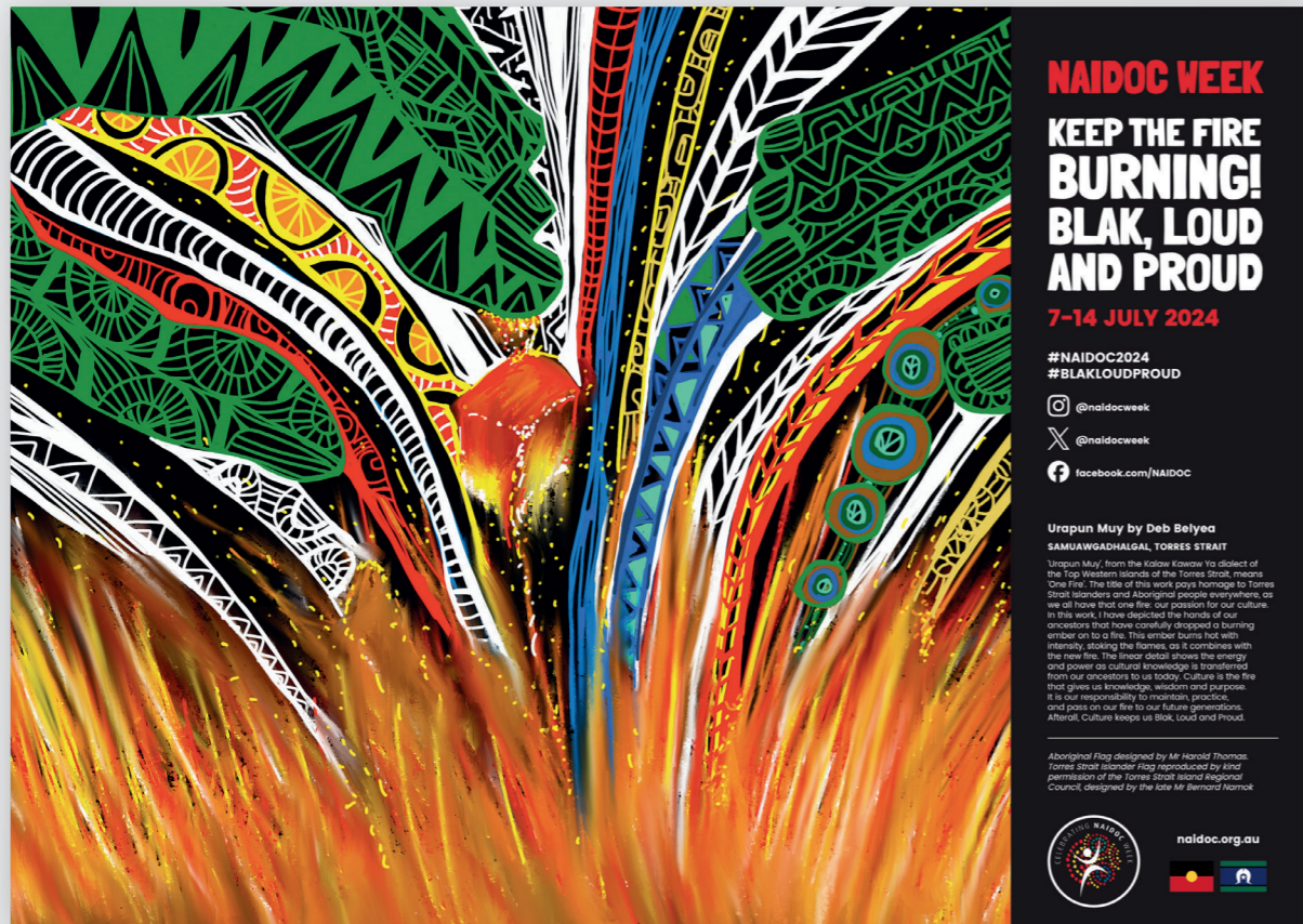
The 2024 NAIDOC Poster.