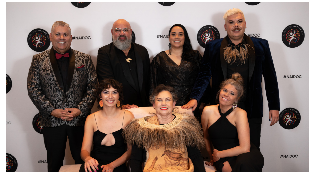
The 2023 National NAIDOC Committee.

Aboriginal and Torres Strait Islander peoples are advised that the following information will contain names, images and stories of people who have now passed.