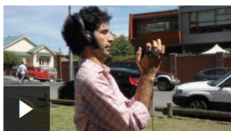
Recording great audio