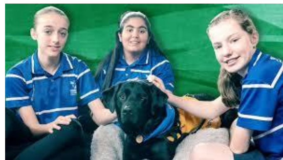
School Support Dog