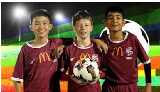
World Football Day