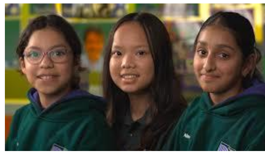
Mother Language Day