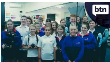
BTN Kids' News Service

Think about making a class podcast to tell stories about what's happening in your community. Watch these BTN stories to hear from school kids who make their own podcast.