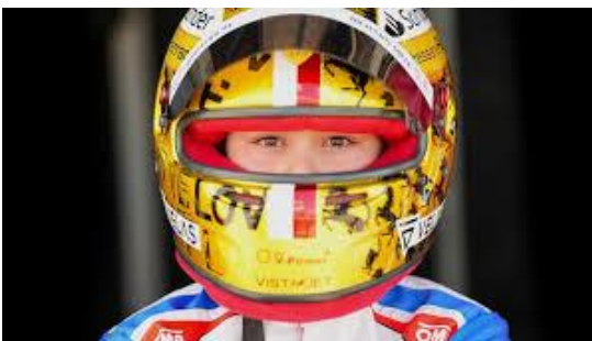
Formula One Dreams