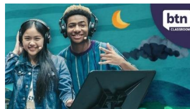
BTN Fictional Podcasts