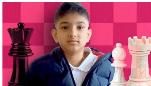
BTN Chess Champ