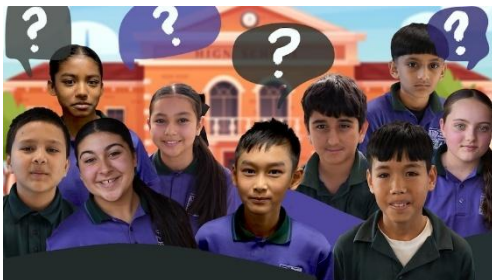
BTN Going to High School