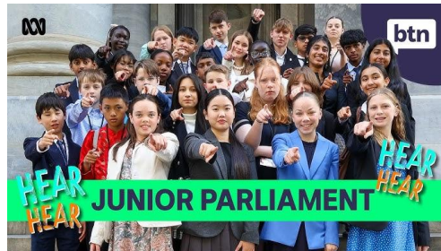
BTN Junior Parliament