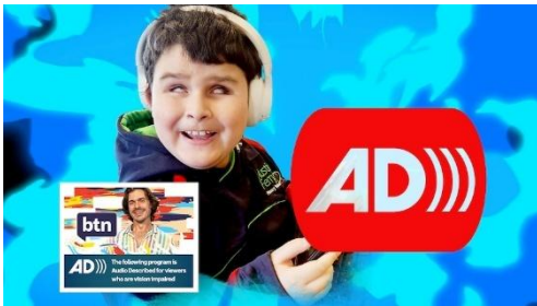
BTN Audio Descriptions