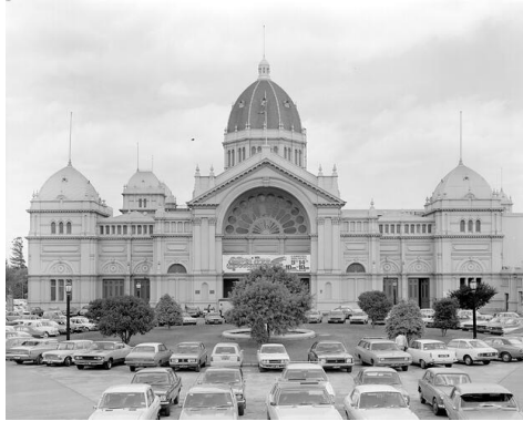
Royal Exhibition Building Museum Victoria