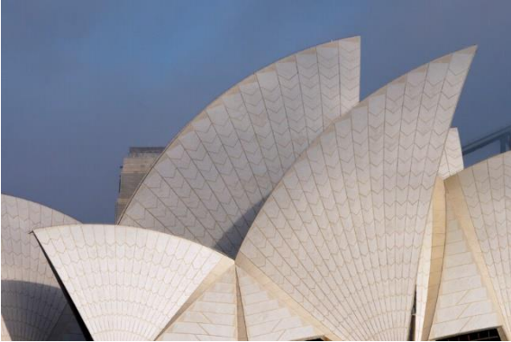
Sydney Opera House - UNESCO

Students will choose one heritage building in their local area to investigate and become experts. Students will collect and record information from a wide variety of primary and secondary sources and present the information they find in an interesting way. Below are some examples of heritage buildings around Australia.