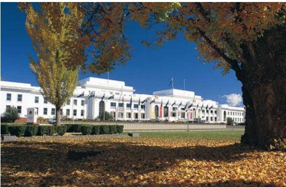
Old Parliament House Canberra - MOAD