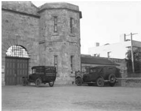
Fremantle Prison – State Library WA

Students will respond to the following questions: