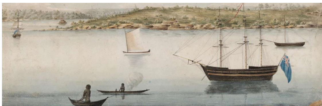
Sydney Opera House website - Tubowgule