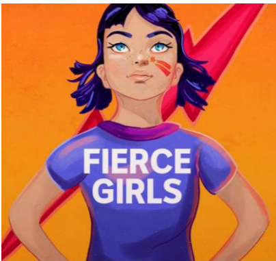
Fierce Girls – ABC

Students will explore and listen to a podcast that has been written for kids. Students can choose one of the following ABC podcasts or choose another podcast that interests them.