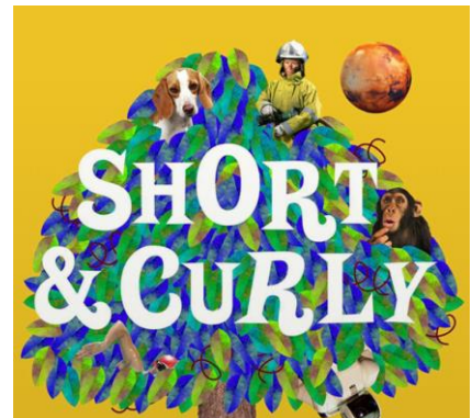
Short & Curly – ABC

After listening to an episode of their chosen podcast, students will then respond to the following questions: