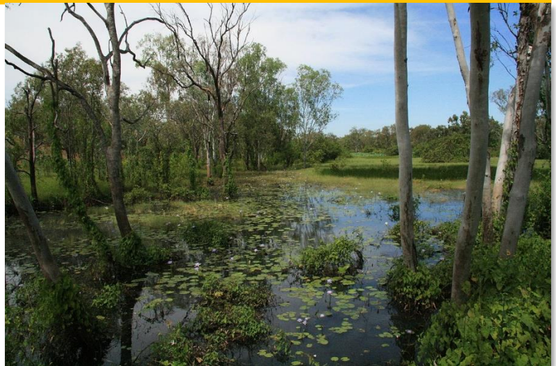
Daly River, Northern Territory.