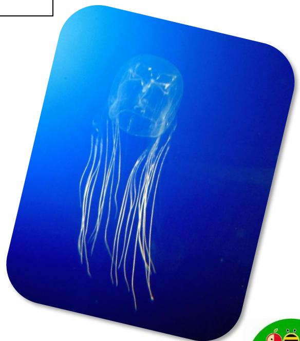
Image left: Wikimedia commons, marrutj (mud crab). Image right: Wikipedia, meme (box jellyfish)