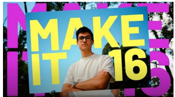
BTN – Voting Age

As a class brainstorm a list of arguments for and against the issue, using a T-chart to record your student's responses.