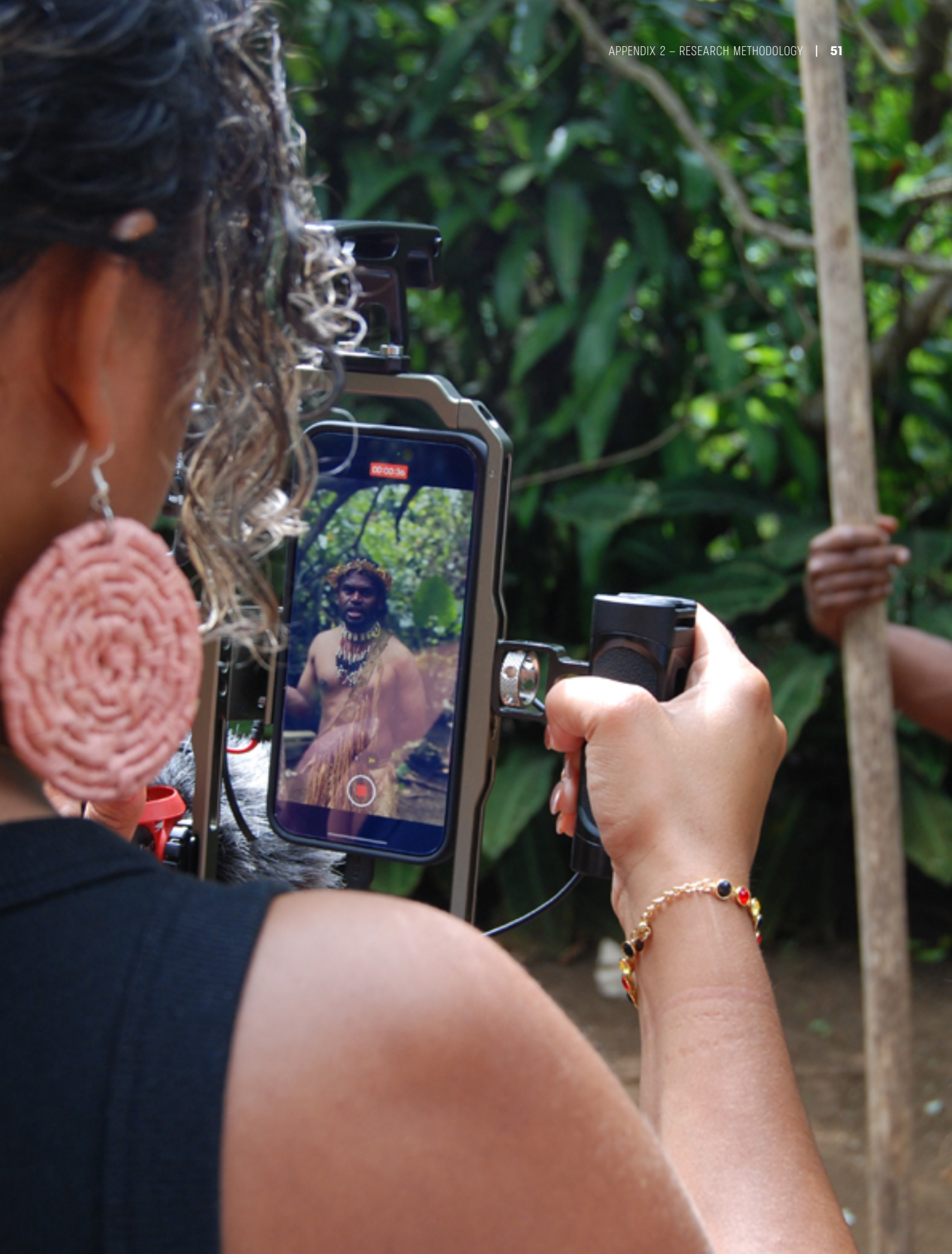
Shooting vertical video at the Pepeyo Cultural Village in Port Vila.