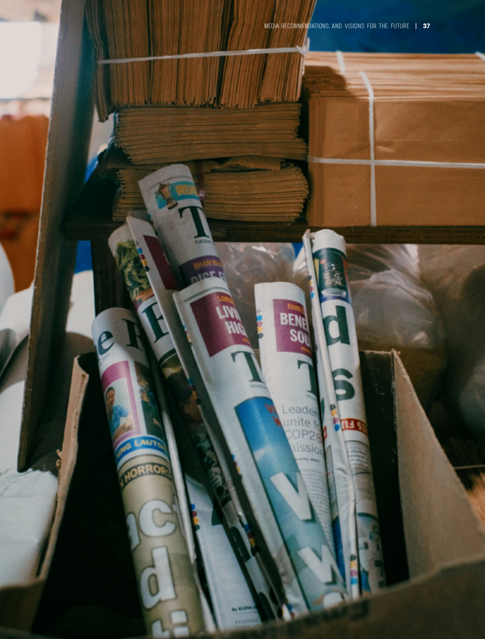
Fiji Times newspaper for sale, Savusavu Market, Vanua Levu, Fiji.