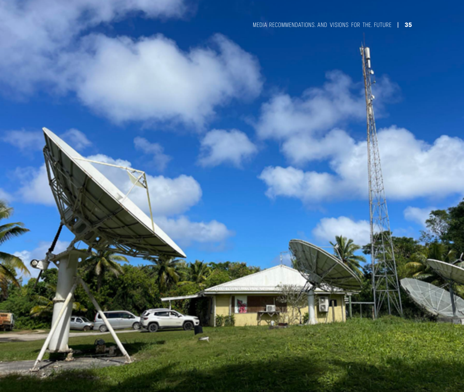
Headquarters of the Broadcasting Corporation of Niue.