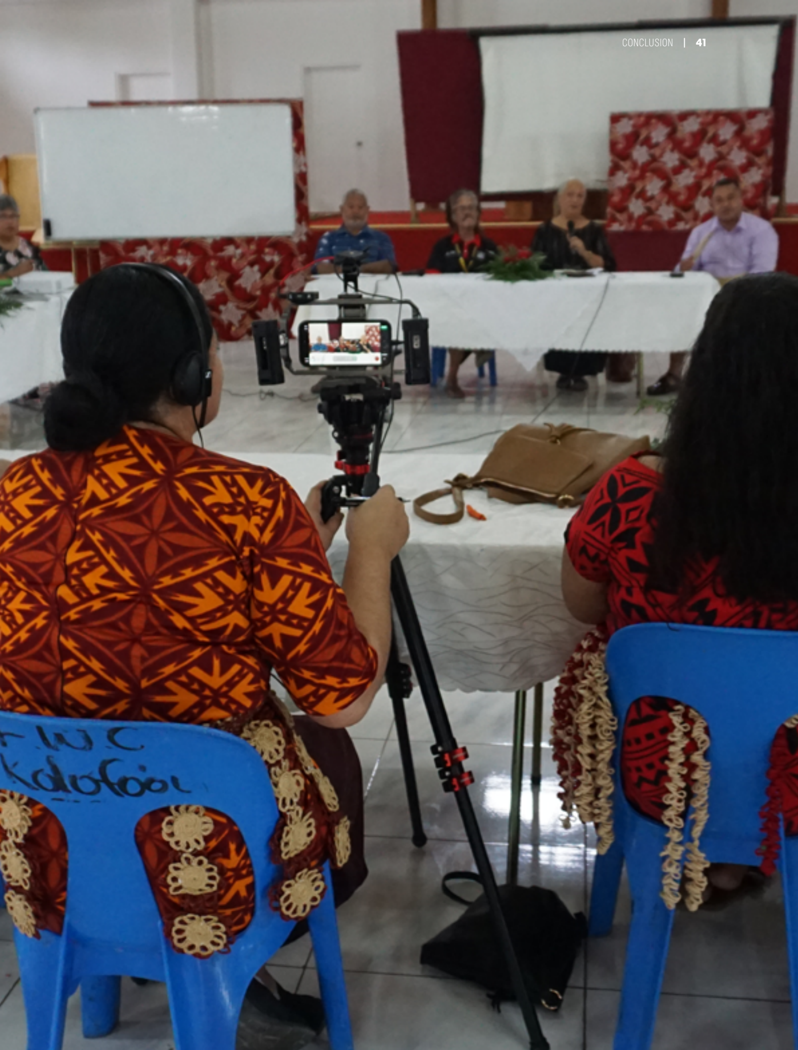
Young journalists interview veterans of the Tongan media.