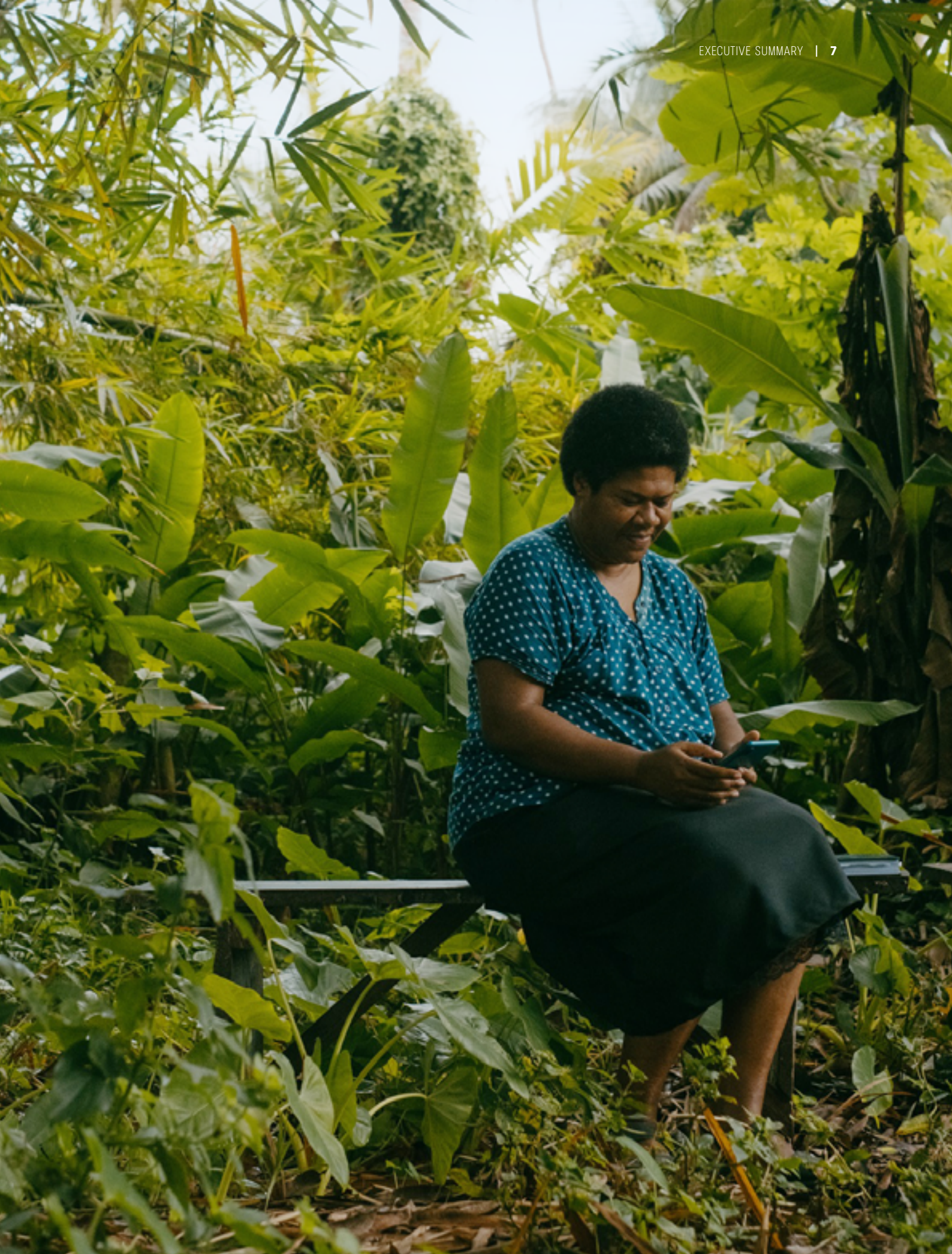
Reading the news in Lekutulevu, Vaturova, Cakaudrove Province, Vanua Levu, Fiji.