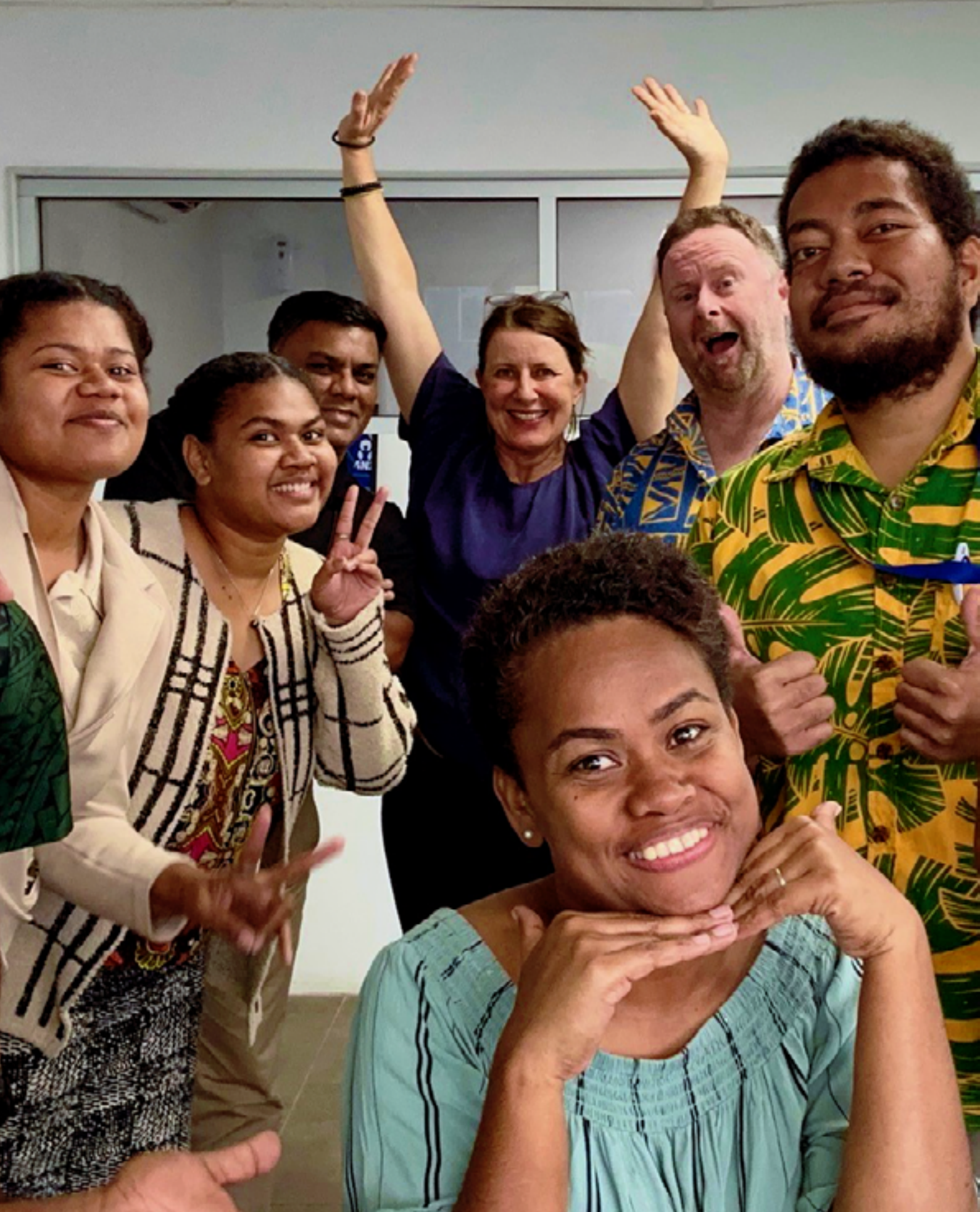
Mobile journalism training at the Fiji Sun.