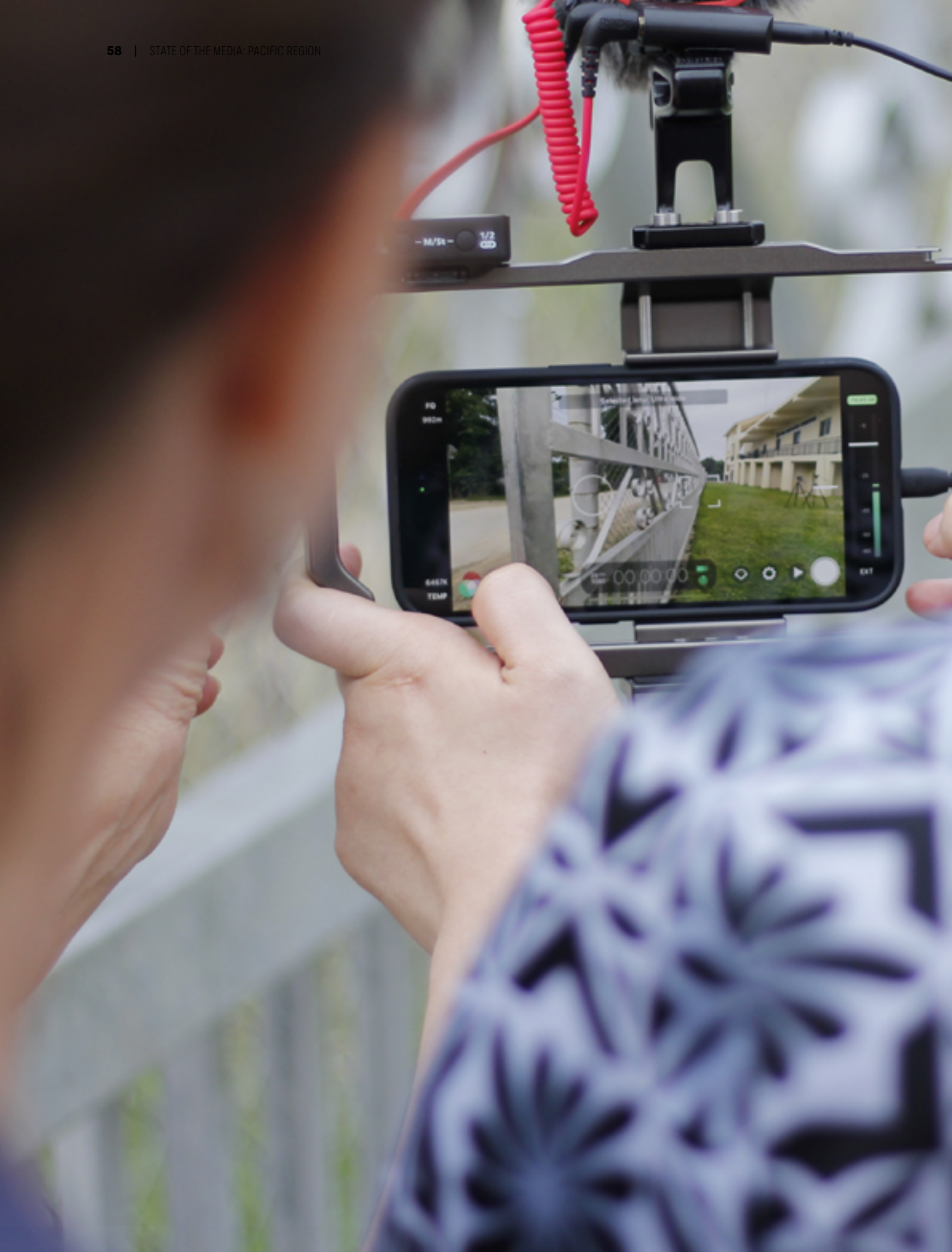
Learning to shoot with a mobile phone at Tonga Broadcasting Commission.