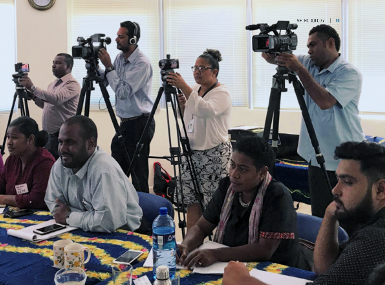
Covering a Minister's presentation to the media during a budget reporting workshop in Fiji.

A central challenge discovered during fieldwork was that access to certain groups was hard to establish, particularly in nations where the media operates under stringent government regulation. As such, the views represented in this study cannot be regarded as exhaustive. Both the interview and the survey questions are included as appendices 3 and 4 to this report. Fieldwork was conducted between January and July 2024.