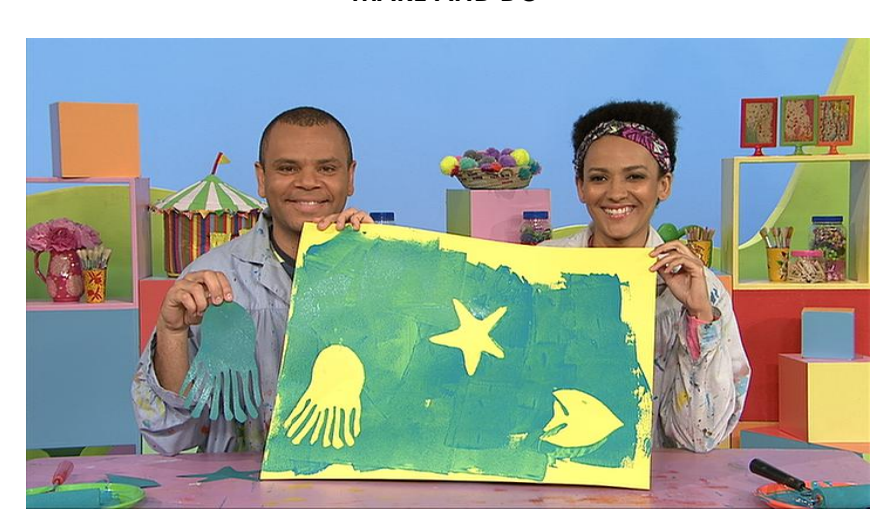
How to Make an Underwater Painting