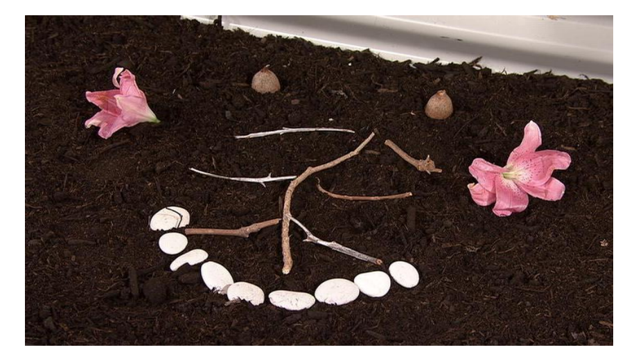
How to Make a "Buggy" Picture