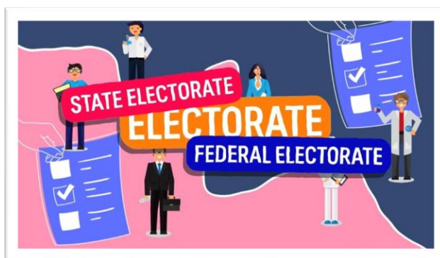
BTN video – Electorates

As a class, watch BTN's Election Lingo explainer to learn more about electorates, and build on your student's political awareness. Discuss the BTN story as a class and record the main points of the discussion. Students will then respond to the following discussion questions.