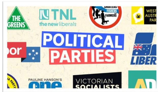
BTN video – Political Parties

As a class, watch BTN's Political Parties explainer to learn more about Australia's different political parties. Discuss the BTN story as a class and record the main points of the discussion. Students will then respond to the following discussion questions.