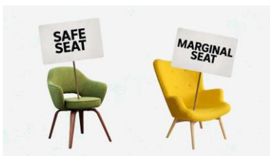
Safe and Marginal Seats