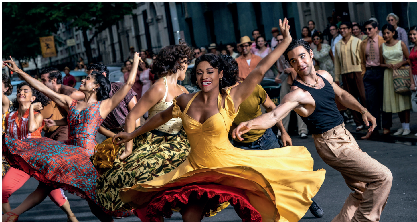
Ariana DeBose as Anita and David Alvarez as Bernardo in Steven Spielberg's acclaimed 2021 film of West Side Story , showing the universality of its themes of love across a cultural divide; it is Bernardo's murder that revives the seemingly endless cycle of violence between rival factions

This was, after all, music to accompany tragedy, not comedy. As a contemporary reimagining of Romeo and