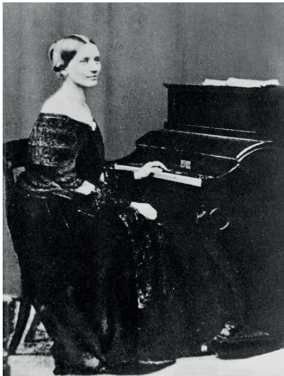
Clara Schumann at the piano; not only was she acclaimed as one of the greatest pianists of the Romantic era, she was also a composer, a devoted wife and mother, and editor of her husband's works

Except for 'My response', all five sections comprise intimate sketches or imaginary outlines of the relationship between Clara and Robert. My original idea was to transfer onto an ephemeral canvas the internal sounds of each one