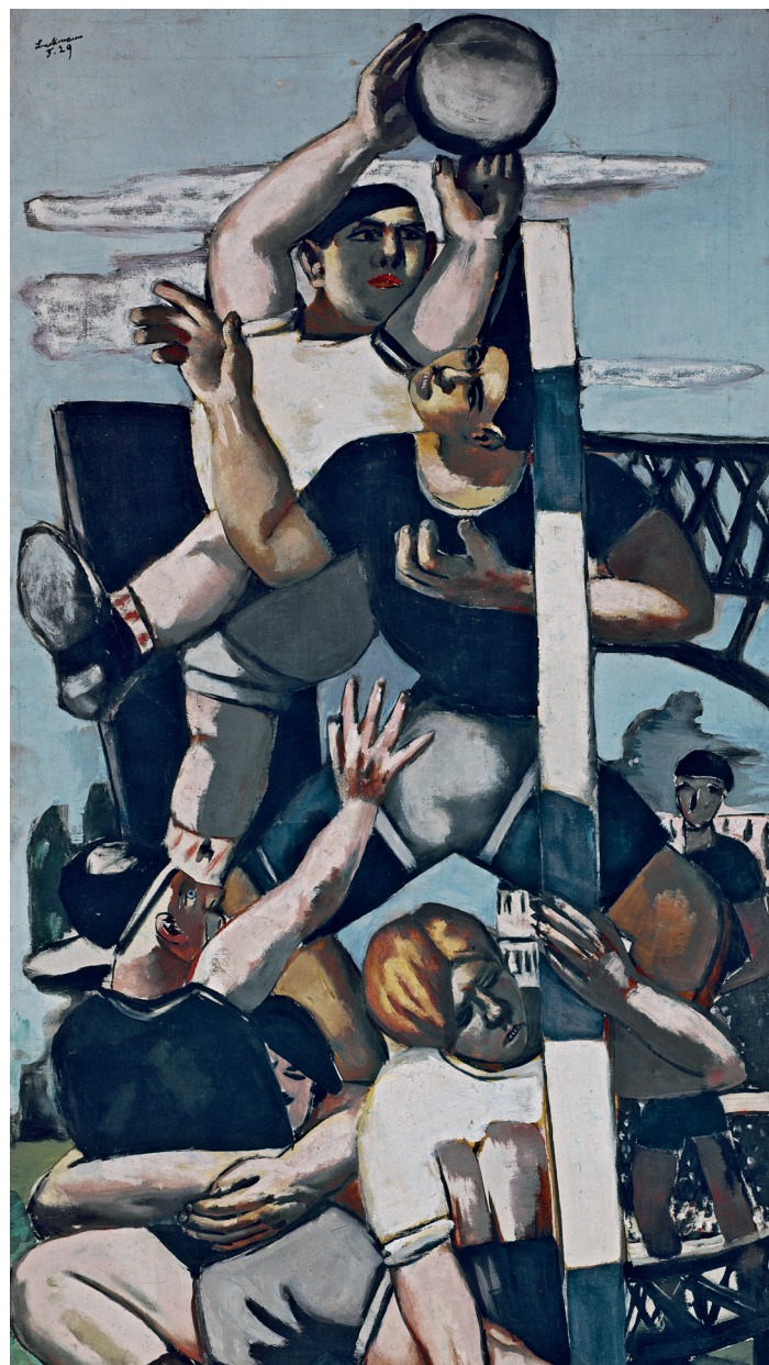
Rugbyspieler ('Rugby players'), painted in 1929 by the German artist Max Beckmann (1884–1950); just a year earlier Honegger captured the energy of the sport in one of his most compelling tone-poems

No doubt they were hoping for a repeat of his hugely successful Pacific 231 , and they were not disappointed. Again, rhythm is the predominant element, and on the harmonic front we are given enough glimpses of D major along the way, especially in the second ‘half’, to make the final blaze of that chord both relevant and satisfying. The