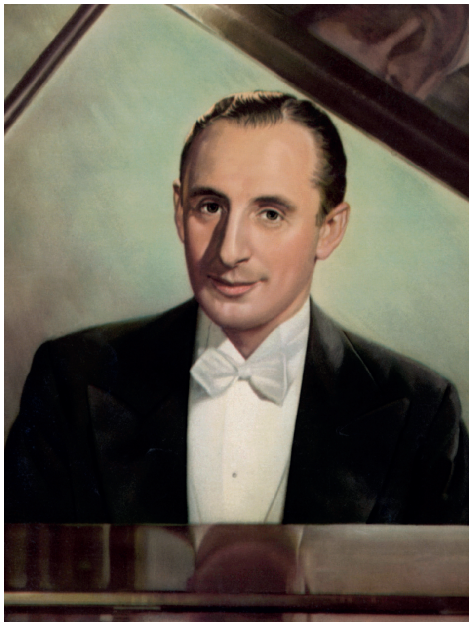
Vladimir Horowitz (1903–89), whose 1930 premiere recording of Rachmaninov's Third Piano Concerto with Albert Coates conducting the London Symphony Orchestra helped cement its reputation

Between his Second and Third Piano Concertos, Rachmaninov's career as composer, pianist and conductor advanced on all fronts, creating problems by its very success. In 1906–7 he wintered in Dresden, largely to avoid the temptation to conduct and thereby to help him forge ahead with composing his Second Symphony and First Piano Sonata. Still much exercised by financial worries, he had the lucrative prospect of an American tour as pianist, for which he had in mind a third piano concerto, whose ideas began to germinate at this time.