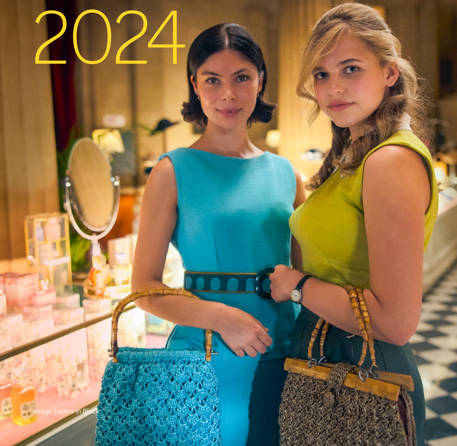
Image: Ladies in Black