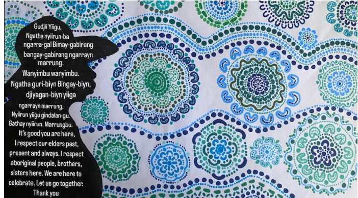
ABC Education - An Acknowledgement of Country poster in Gathang language submitted by Bulahdelah Central School, NSW. ( Bulahdelah Central School, NSW )

If you can't find your local language, or if you are having trouble with the translation, please contact First Languages Australia , who may be able to put you in contact with a local language educator who can help.