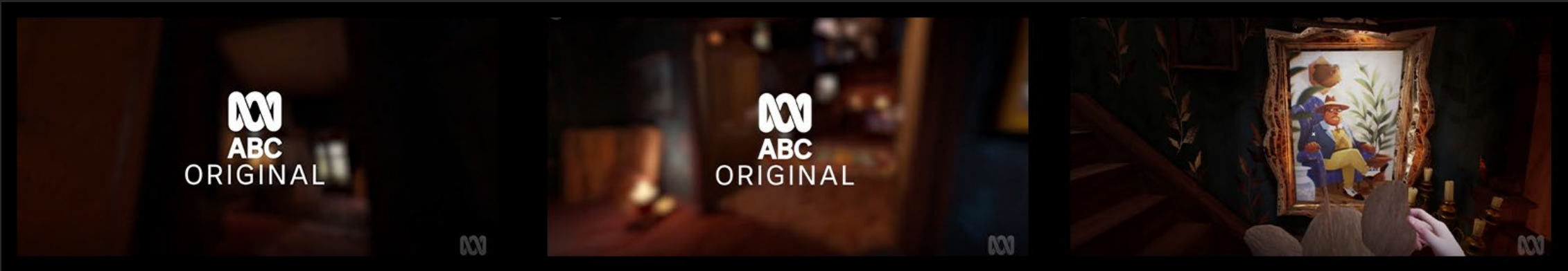
AN EXAMPLE OF THE STACKED LOGO ANIMATION USED IN SEQUENCE OVER VISION