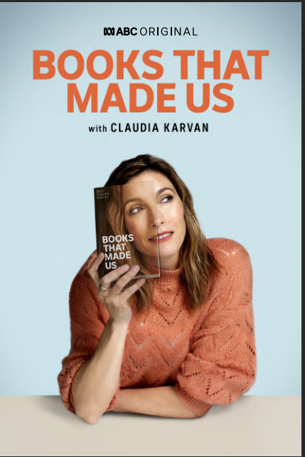
EXAMPLES OF USAGE IN KEY ART