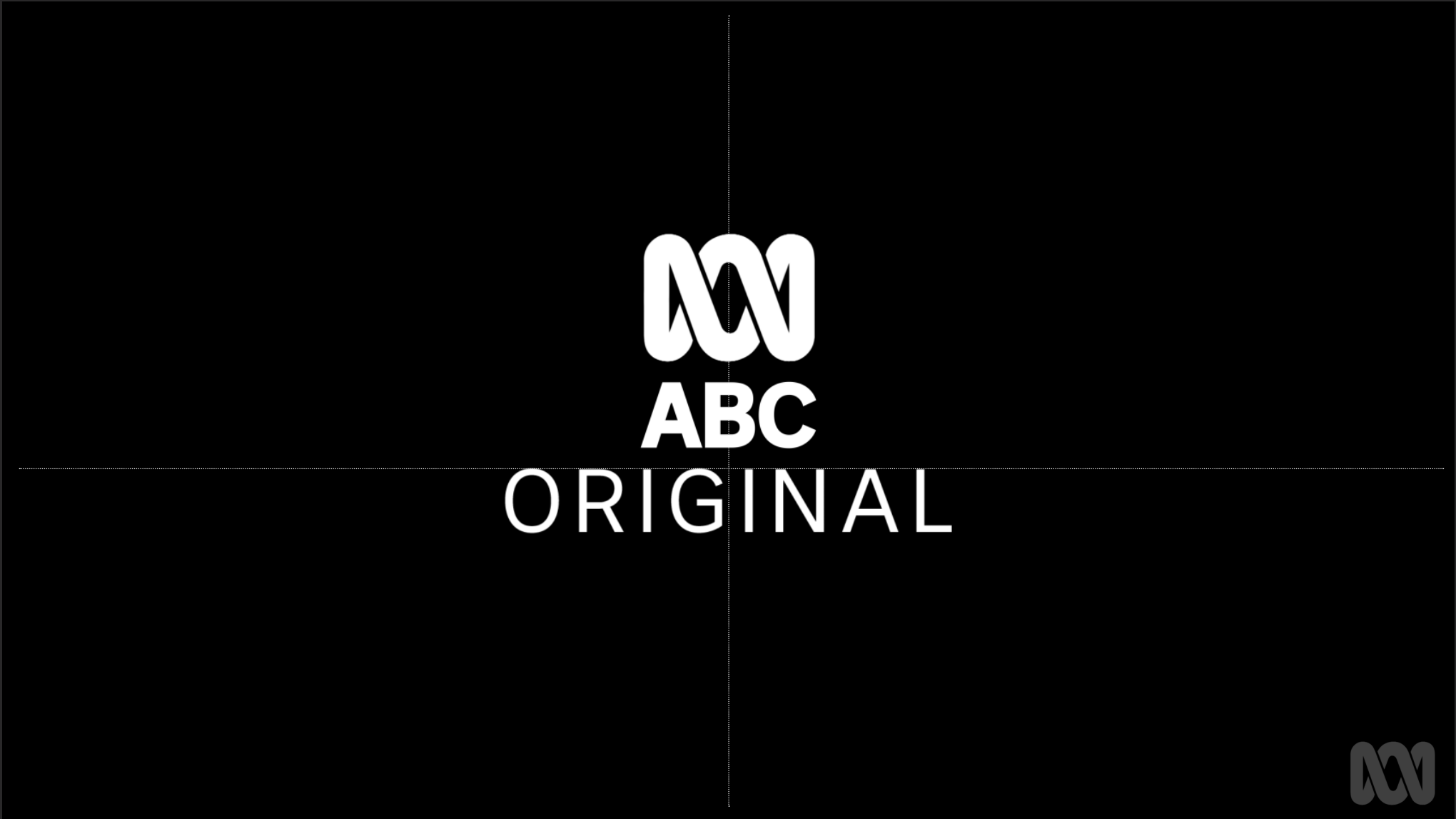
ON SCREEN LOGO PLACEMENTS: CENTRED 1/3