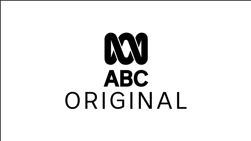
LOGO STACKED BLACK