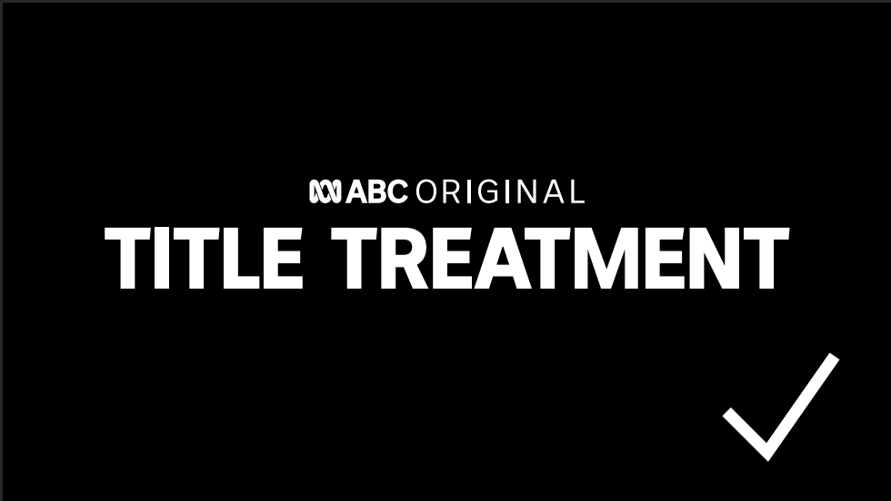
CORRECT: LOGO AND TITLE TREATMENT@100% / LOGO@40%