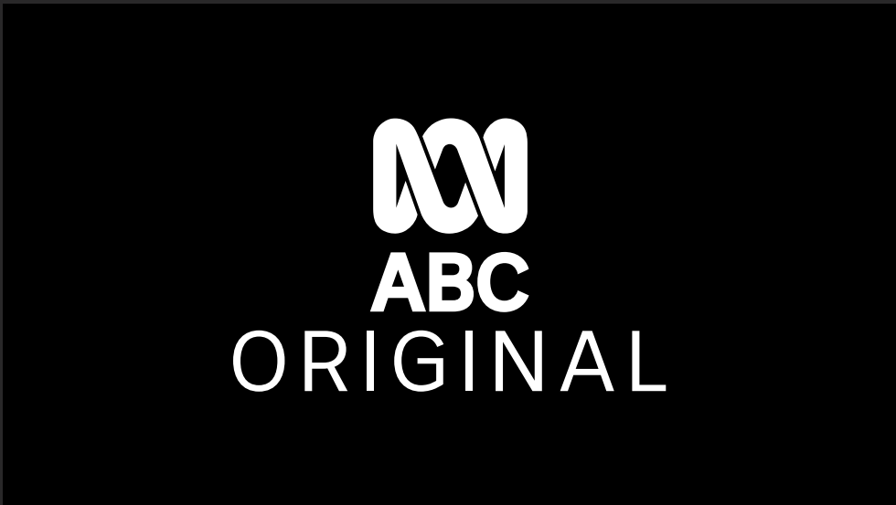
LOGO STACKED WHITE

They are available on the Producer Portal .