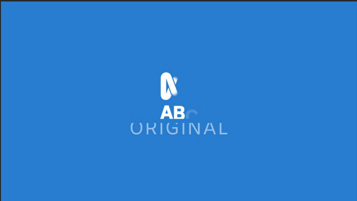
ABC KIDS ONLY