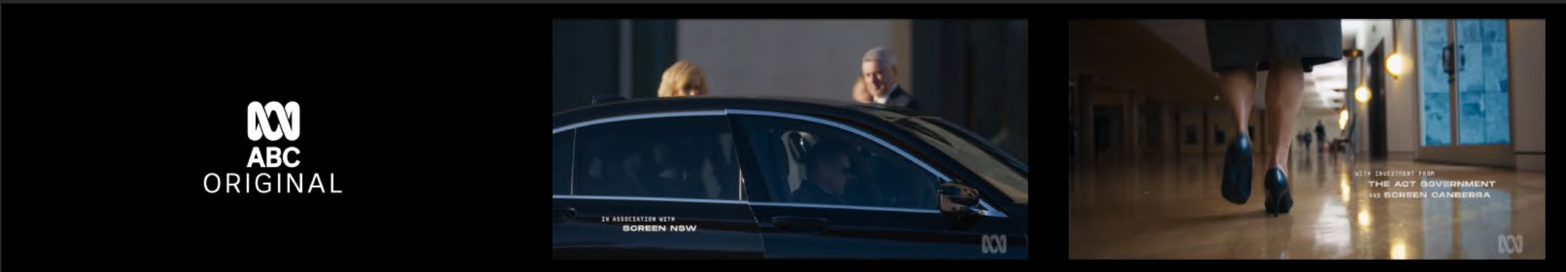
AN EXAMPLE OF THE STACKED LOGO ANIMATION USED IN SEQUENCE OVER BLACK