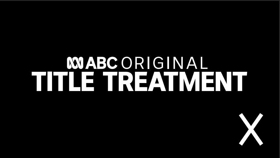
WRONG: LOGO TITLE TREATMENT@100% / LOGO@65%