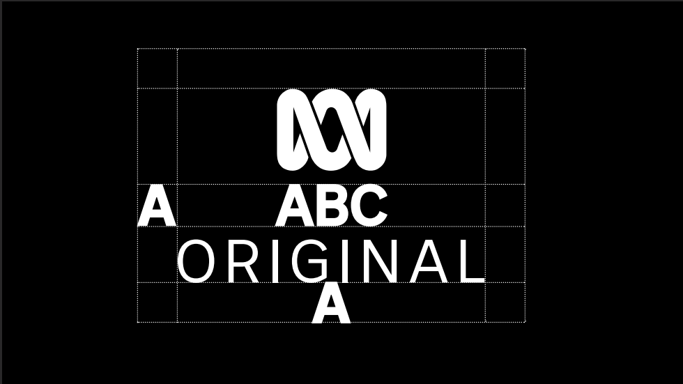
MINIMUM LOGO STACKED CLEARSPACE: X1A