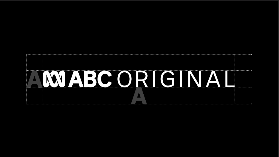
MINIMUM LOGO LANDSCAPE CLEARSPACE: X1A