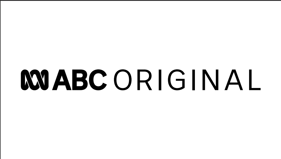
LOGO LANDSCAPE BLACK