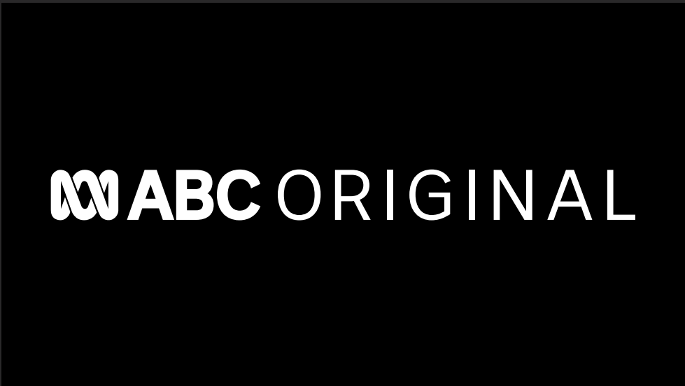
LOGO LANDSCAPE WHITE