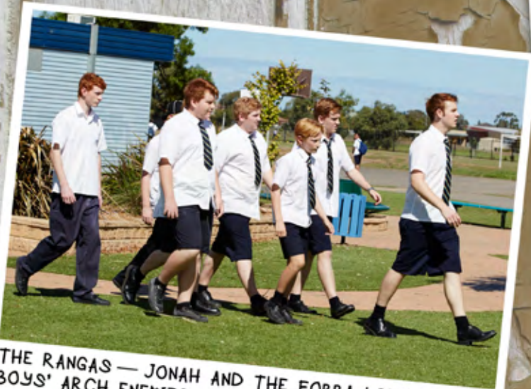
THE RANGAS — JONAH AND THE FOBBA-LISCIOUS BOYS' ARCH ENEMIES