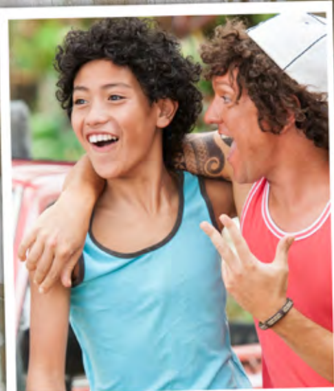
MOSES, JONAH'S BROTHER