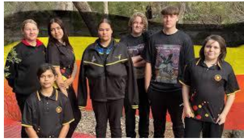
Reconciliation Week 2024