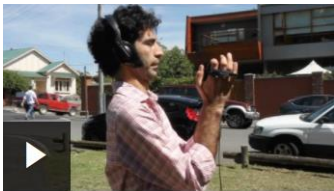
Recording great audio