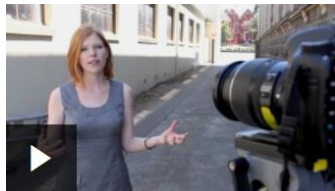
Shooting the story