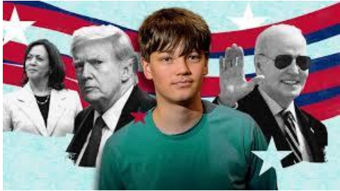
US Politics Interview