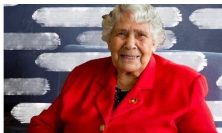
Dr Lowitja O'Donoghue