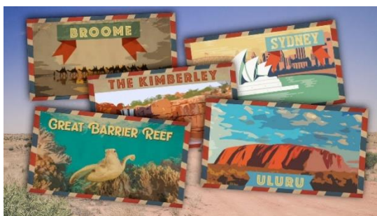
Indigenous Place Names

Students can watch one or more of the BTN stories below to learn more about Indigenous languages.