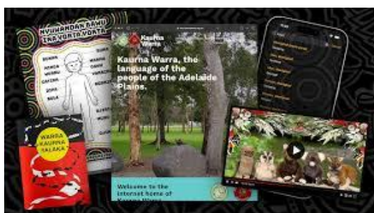
Reviving Indigenous Languages