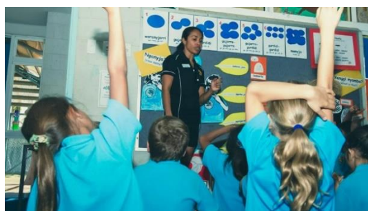
Indigenous Language Lessons