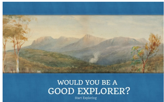
Australia's Defining Moments: Digital Classroom

Would you be a good explorer? Students find themselves in 1813 with the challenge of crossing the Blue Mountains. They must make good decisions to be successful, which will pave the way for the opening up of the colony of New South Wales. Students can play this game on the digital classroom.