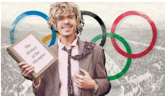
BTN Olympic Games History

To learn more about the history of the Olympic Games and how they have changed over time, check out the videos below.