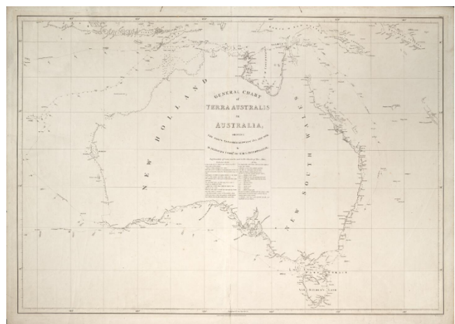
General Chart of Terra Australis or Australia