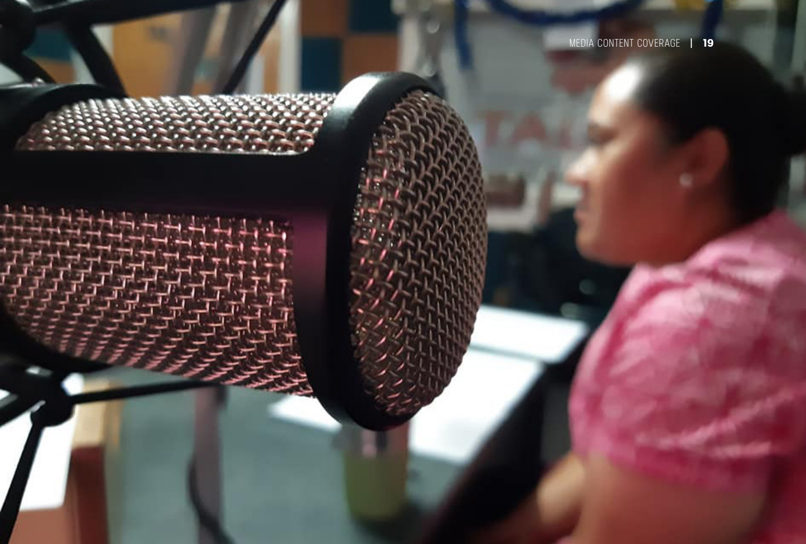
In the studio of Talofa FM.

Media practitioner respondents noted a growing audience demand for content featuring stories on national developments: “Everyone wants to see what has been going on, what has been implemented, success stories, failure, and challenges of projects” (Samoa 03). Respondents suggested these stories encourage public participation and emotional investment in national initiatives geared towards ensuring Samoa’s continued progress.