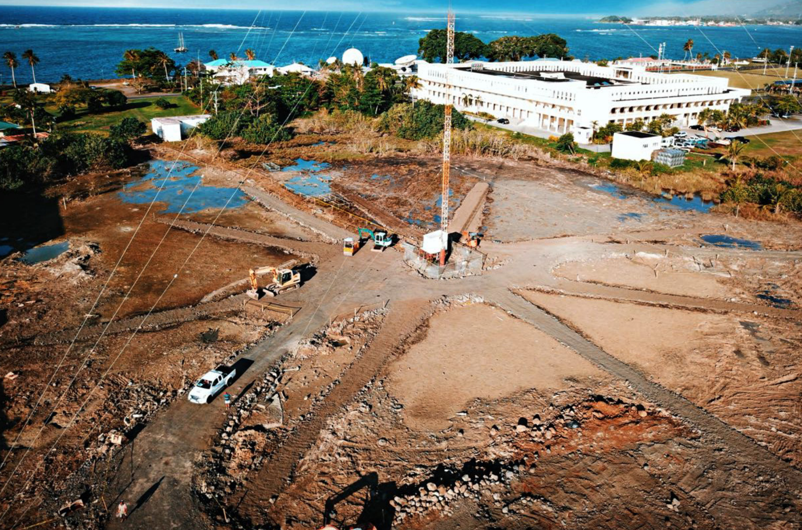
The site of Radio 2AP's new transmission mast, erected in 2019.

In August 2020, Samoa completed its switch to digital TV transmission. Digital TV now covers 99 per cent of the population and is providing higher sound and image quality, as well as interactive services. 45