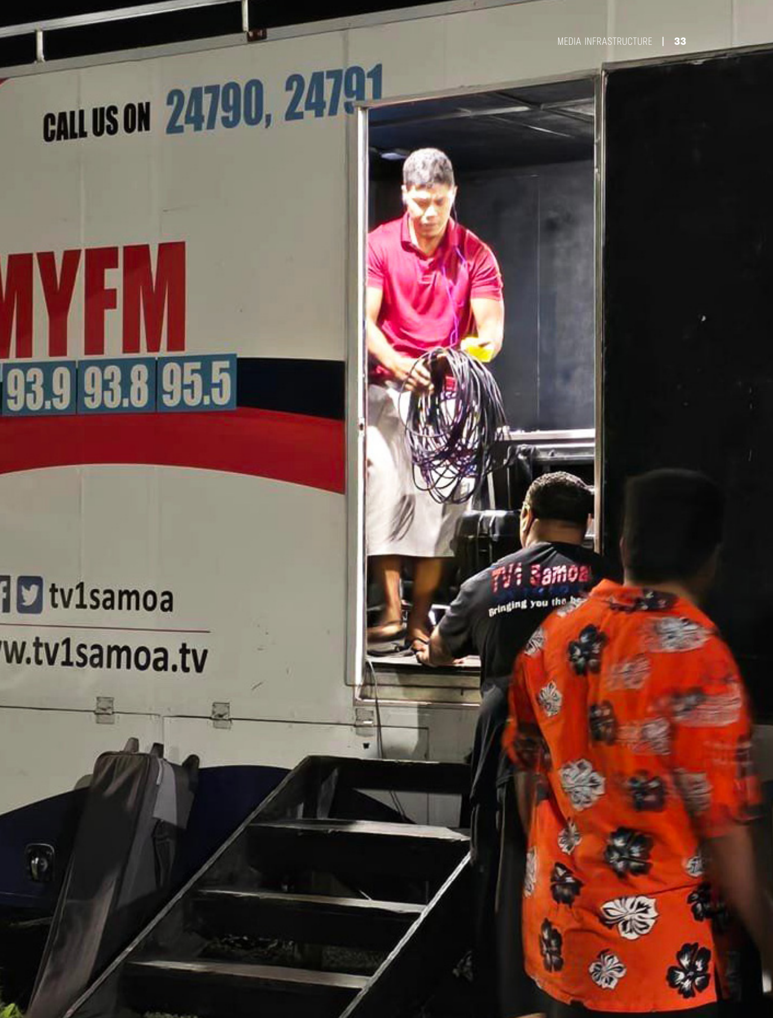
TV1 crew rig for an Outside Broadcast.