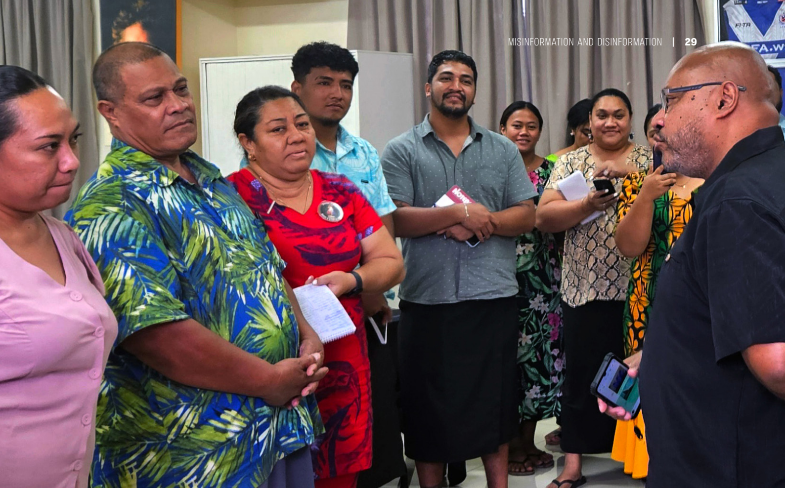
Reporters practice doorstep interview skills at a workshop.

The incidence of mis/disinformation in Samoa became particularly heightened during the country's 2019 measles epidemic and leading up to the COVID-19 pandemic. 38 Anti-vaccination sentiment shared online and in-person impacted measles vaccination rates. 39 The influence of social media has been explored in a number of studies, which have shown it to be a vehicle for misinformation and anti-vaccination campaigns. 40