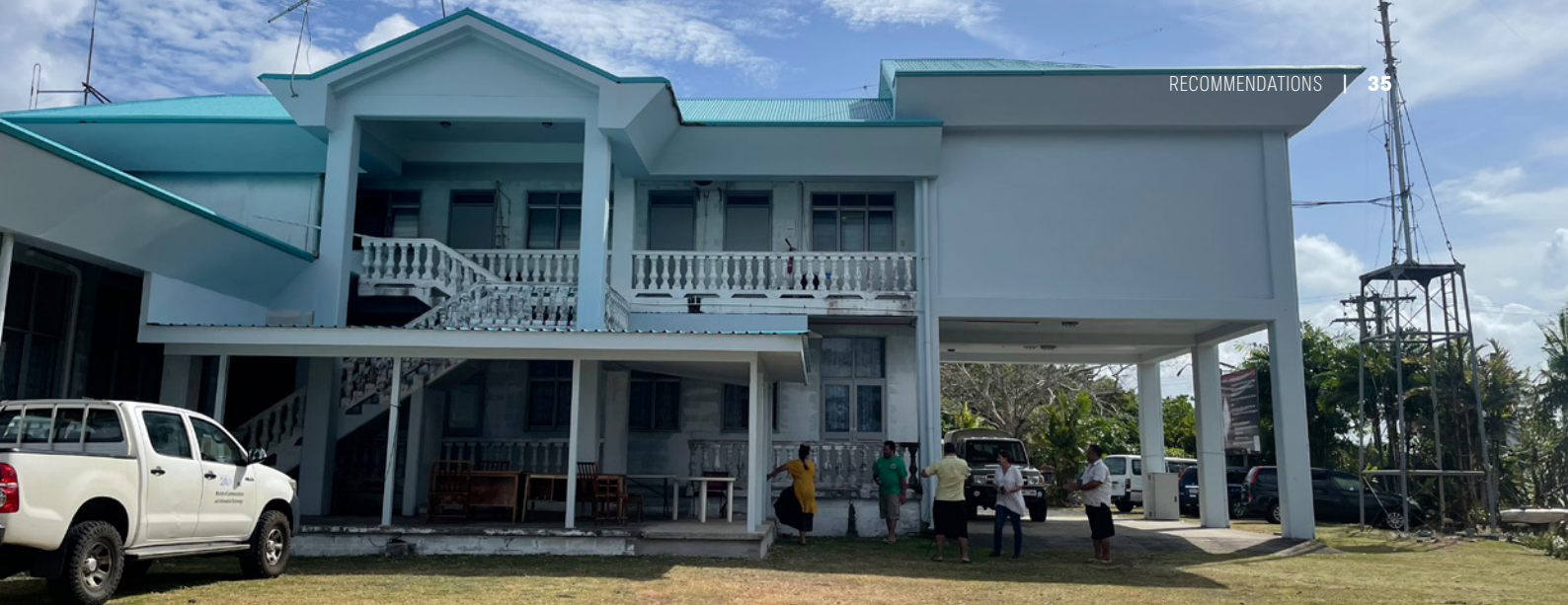
Headquarters of 2AP and TV9 in Apia.