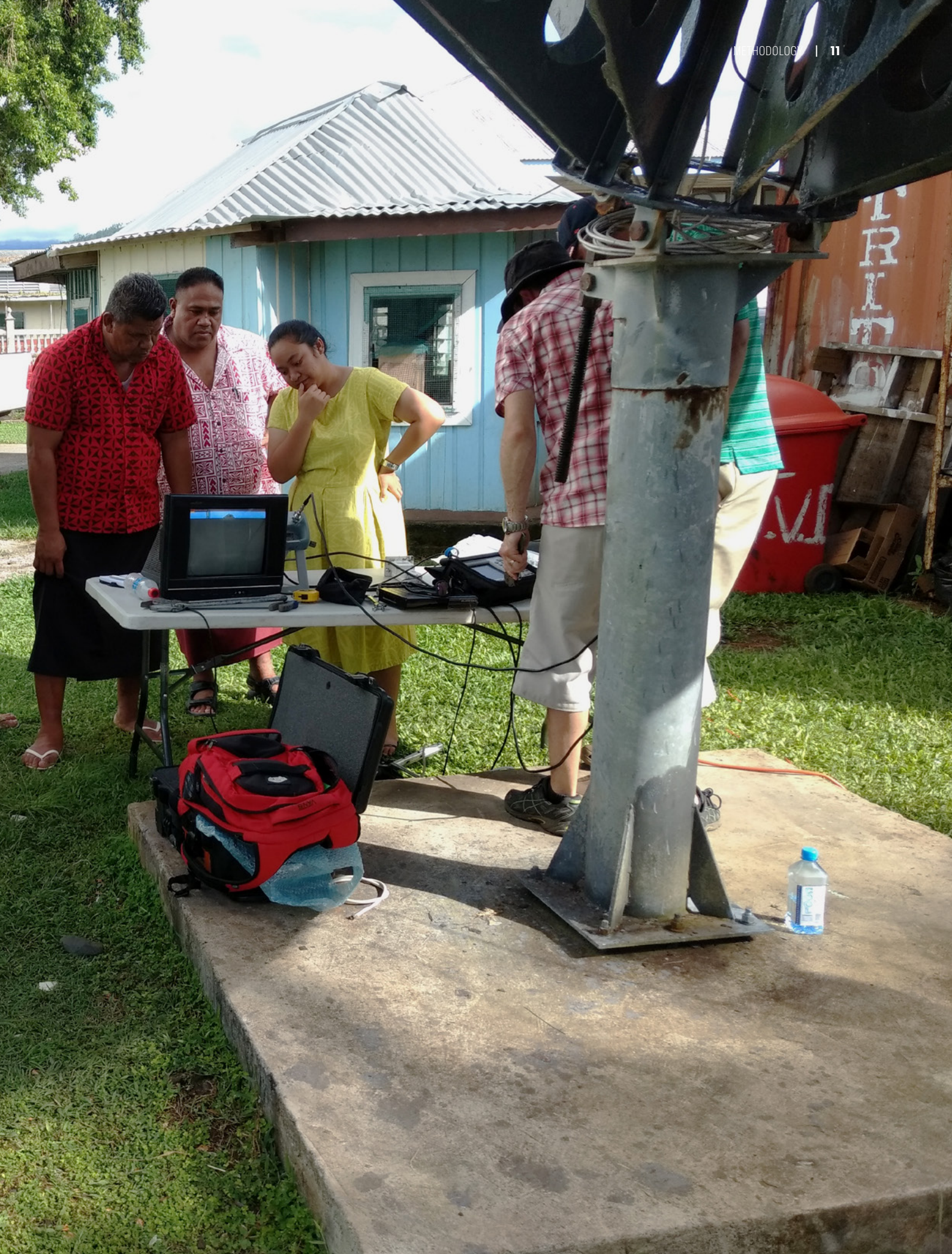
Practical satellite training for Samoa's broadcast technicians.