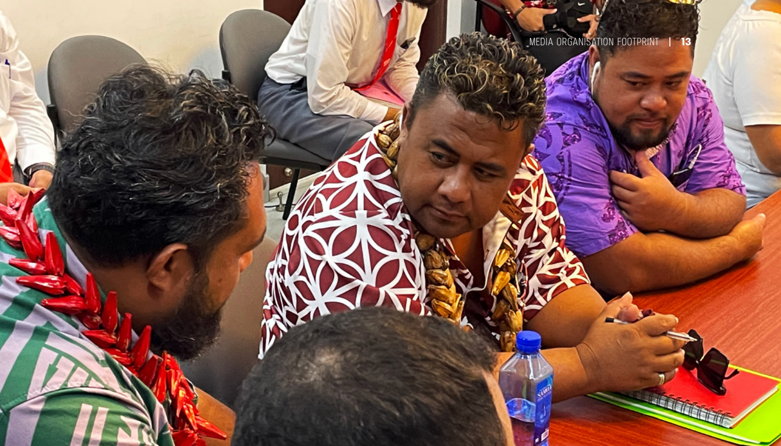
Members of the Samoan media meet at the Parliamentary Reporters' Handbook workshop in 2023.