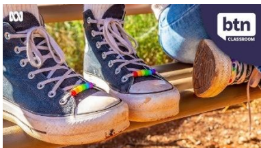
BTN Rainbow Laces

BTN encourages kids to tell their own stories about issues they are interested in or passionate about. Check out BTN's website for the latest BTN Rookie Reports .