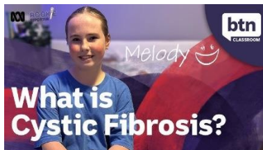
BTN Cystic Fibrosis