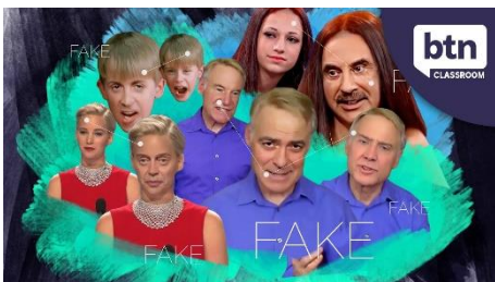
BTN Spotting Deepfakes

Below are more BTN stories which explain what deepfakes are and what you need to know to be able to spot them.