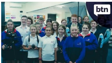
BTN Kids' News Service

Think about making a class podcast to tell stories about what's happening in your community. Watch these BTN stories to hear from school kids who make their own podcast.