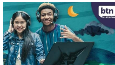
BTN Fictional Podcasts