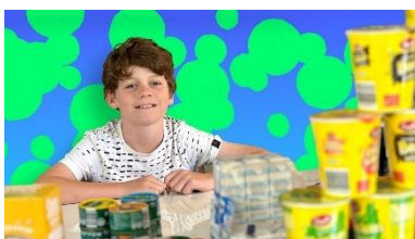
BTN Helping the Homeless