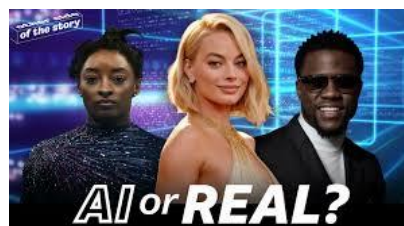
AI or Real?