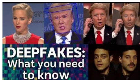
BTN Deepfakes Explained