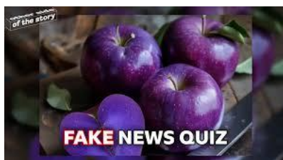
Take the Fake News quiz (Source: BBC Bitesize)