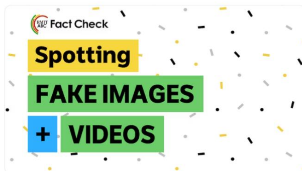
Spotting Fake Images: Interactive Resource

Watch this ABC News video to learn how to verify if an image is fake or not doing a reverse image search.