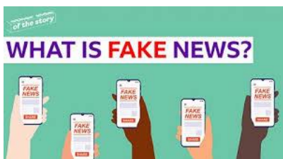
What is fake news?

Students can test their knowledge with these quizzes!