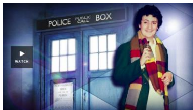
BTN Podcast Kid