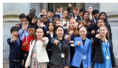
BTN Junior Parliament

Students will then create a news report about an issue they feel strongly about or someone doing something interesting in their community.