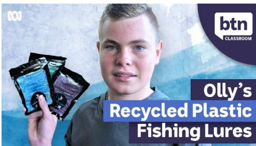
Fishing Lure Business