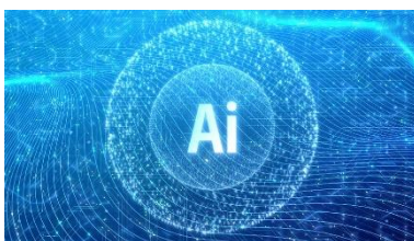
BTN AI Jobs