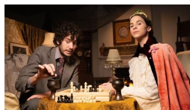
BTN Monarchy Relevance