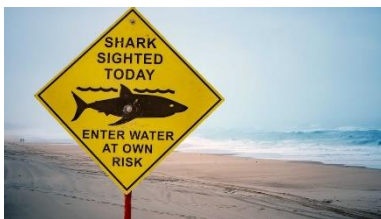
BTN Shark Nets