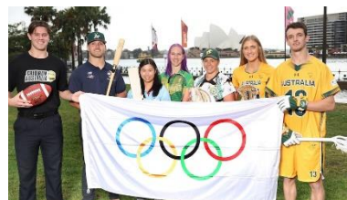
BTN New Olympic Sports