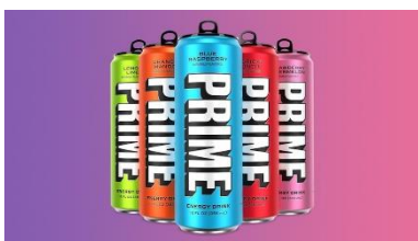
BTN Prime Energy Drink