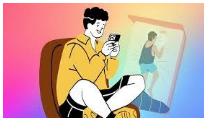
BTN Kids Smartphone Age