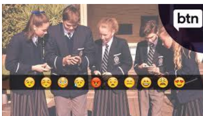
BTN Social Media Negativity