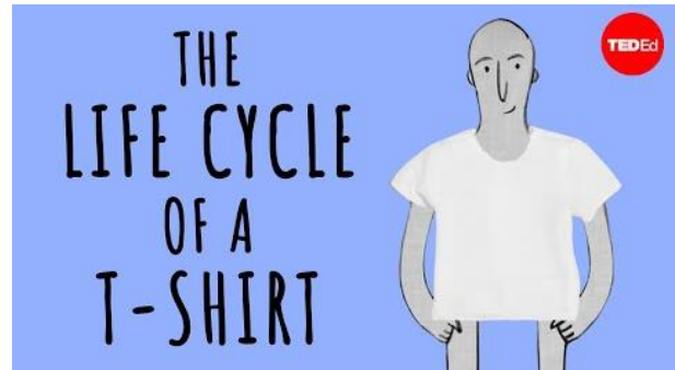
The life cycle of a t-shirt (TEDEd)