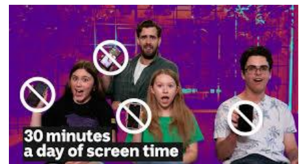
BTN Phone Detox