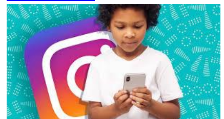
BTN Instagram for Kids