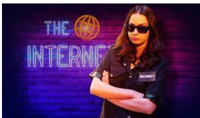
BTN Age Verification Trial

Watch these BTN videos to help students understand more about the issues associated with social media.