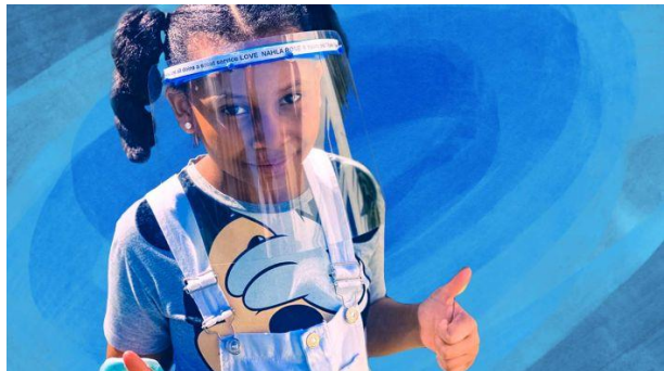
Protective Mask Maker