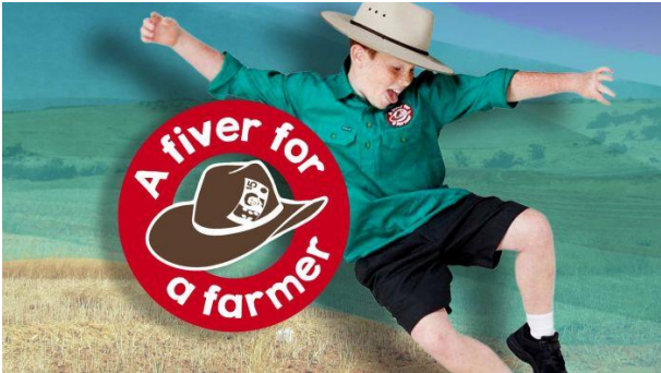
Fiver for a Farmer