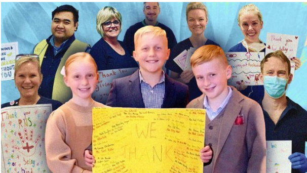
Thank You Project