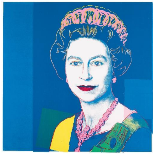
Andy Warhol – Sotheby's

Questions to help guide students' exploration: