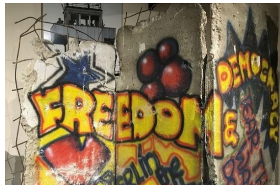
Link to image