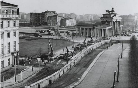
Link to image

Students will choose a photograph and write a short, fictional story based on the image. Students might want to tell the story of the photographer or a person in the photograph. Students will use their research to help them imagine what their characters were thinking and feeling.