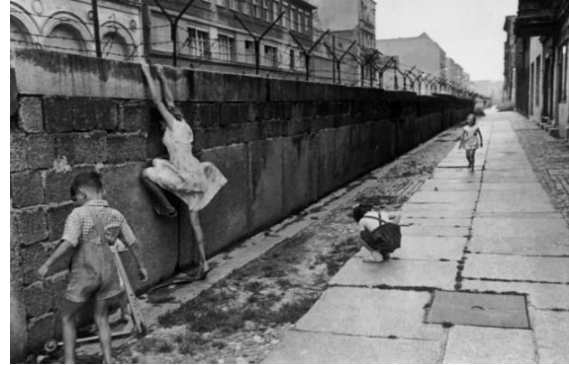
Link to image