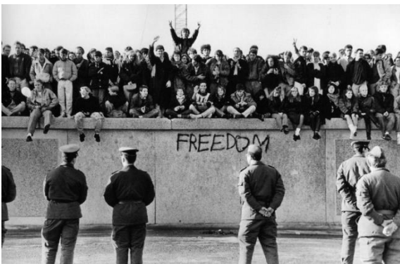
Link to image