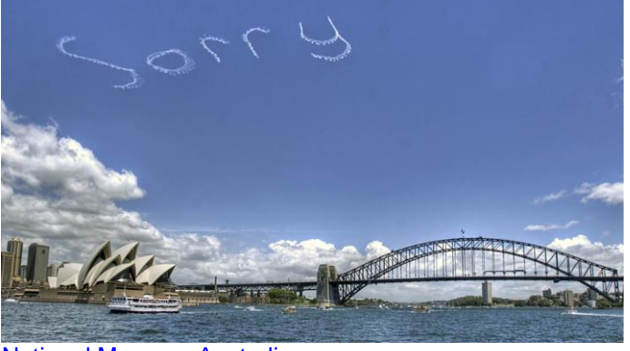
National Museum Australia