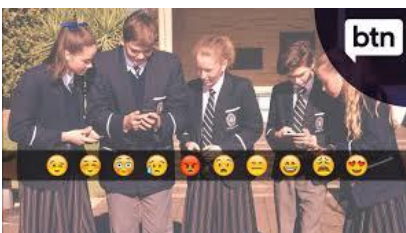
BTN Social Media Negativity