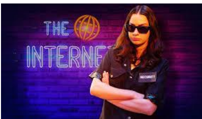
BTN Age Verification Trial

Watch these BTN videos to help students understand more about the issues associated with social media.